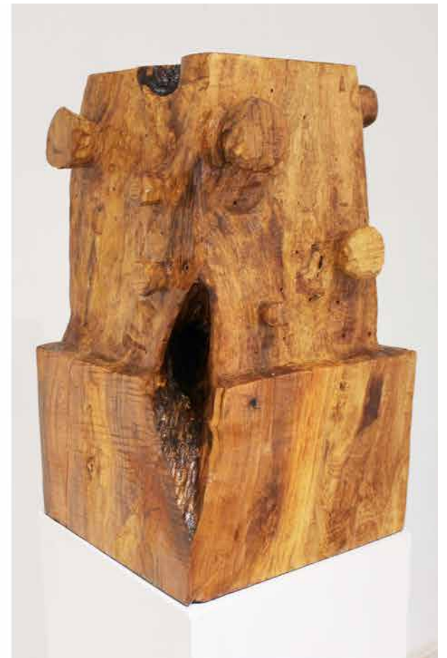
The old, new and unknown, Jacaranda wood, 30 x 30 x 50 cm each.