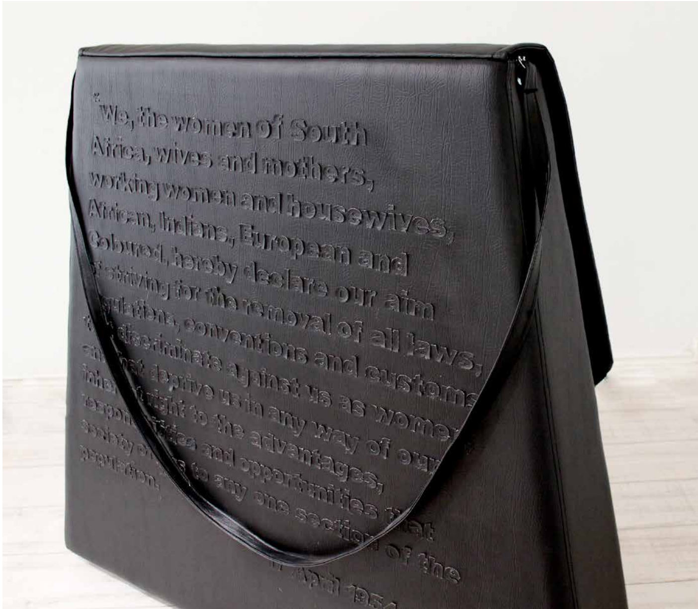
Woman on the move , Jacaranda wood and faux leather, Approx. 123 x 25 x 107 cm, 2017.