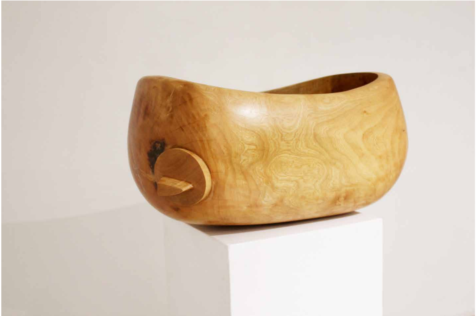
Vessel, Jacaranda wood, Approx. 40 x 66 x 37 cm, 2017.