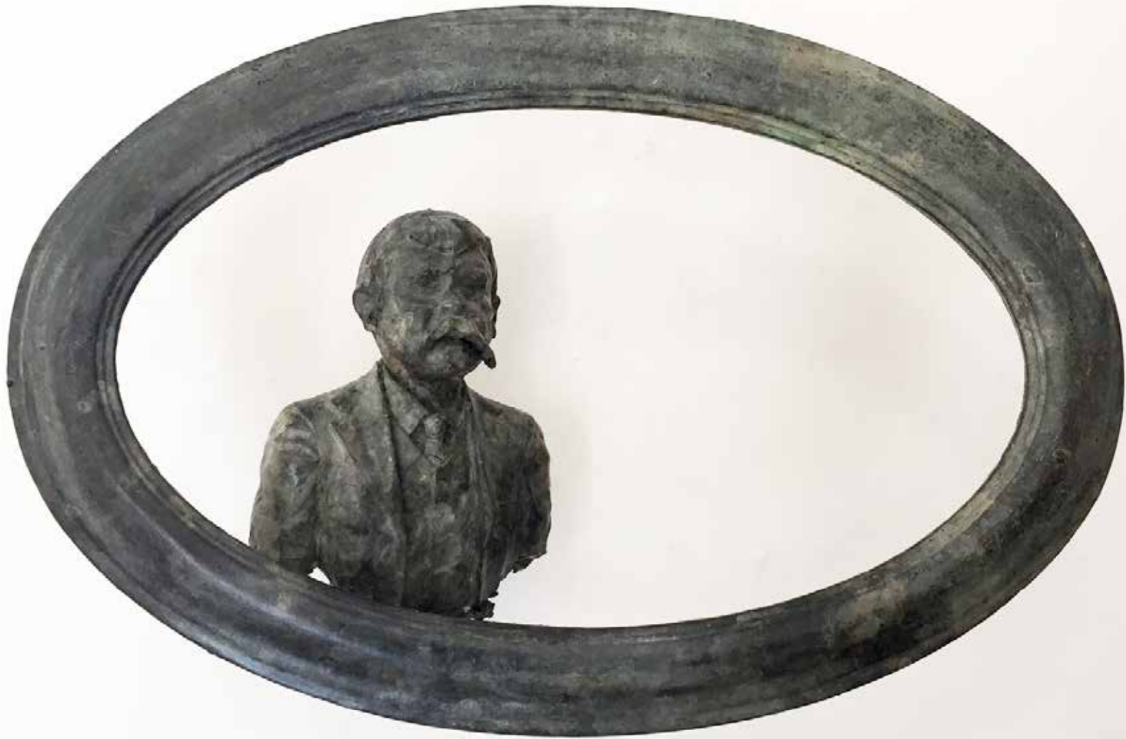
The Mayor (VONO series) , Bronze, 2017, 58cm (width) x 38cm (height) x 22cm (depth).