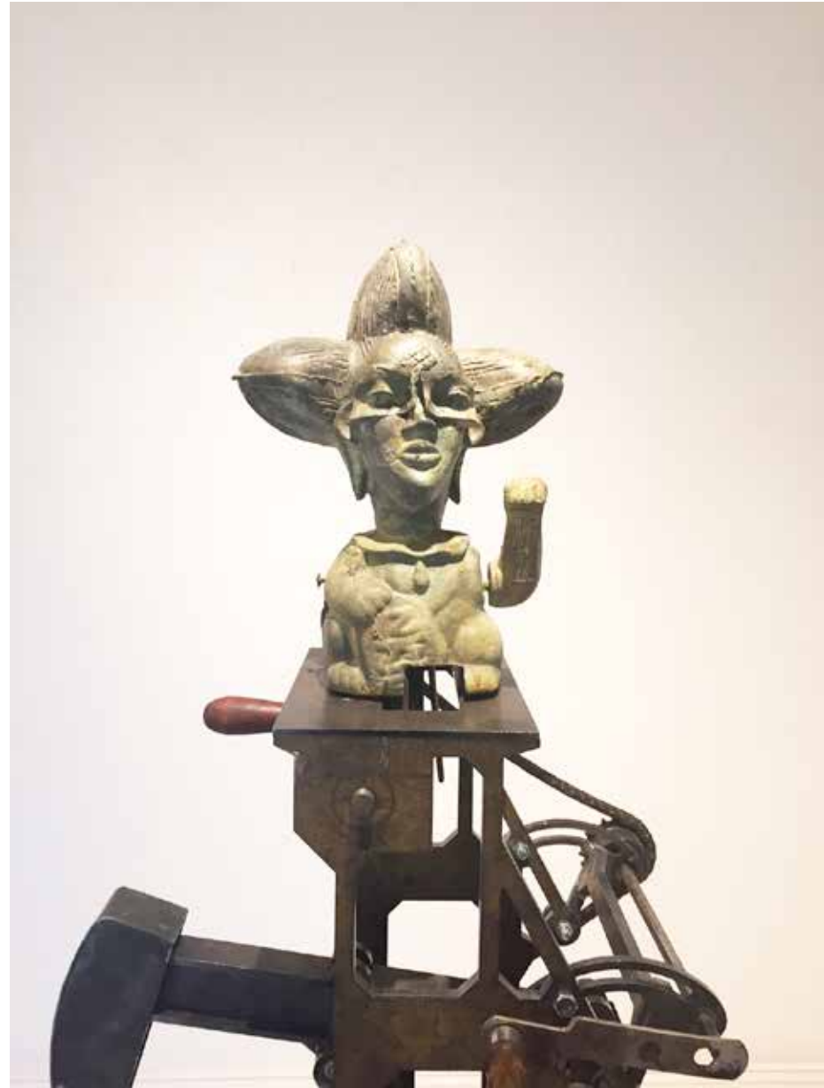
Fortune Cat I , Bronze and Steel, Edition 2 of 7, 2017. Base: 47cm x 31cm x 28cm. Height 152cm.