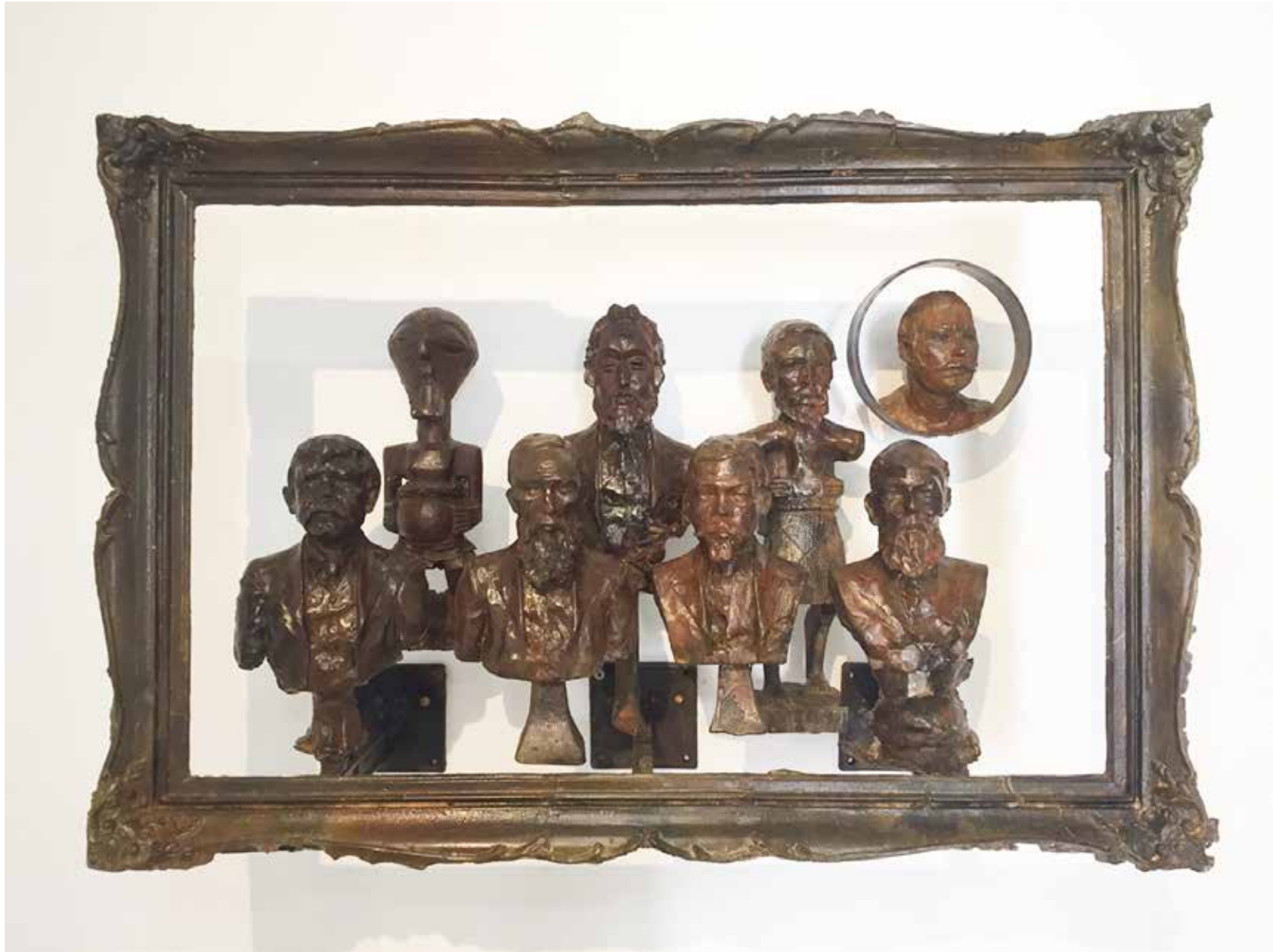
The men that built the church (VONO series), Bronze, 2017, 92 (width) x 62cm (height) x 37cm (depth).