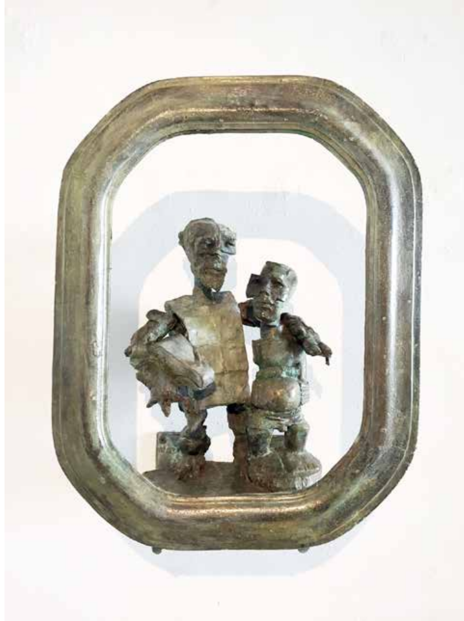
The diver and his son (VONO series) , Bronze, 2017, 44cm (width) x 56cm (height) x 37cm (depth).