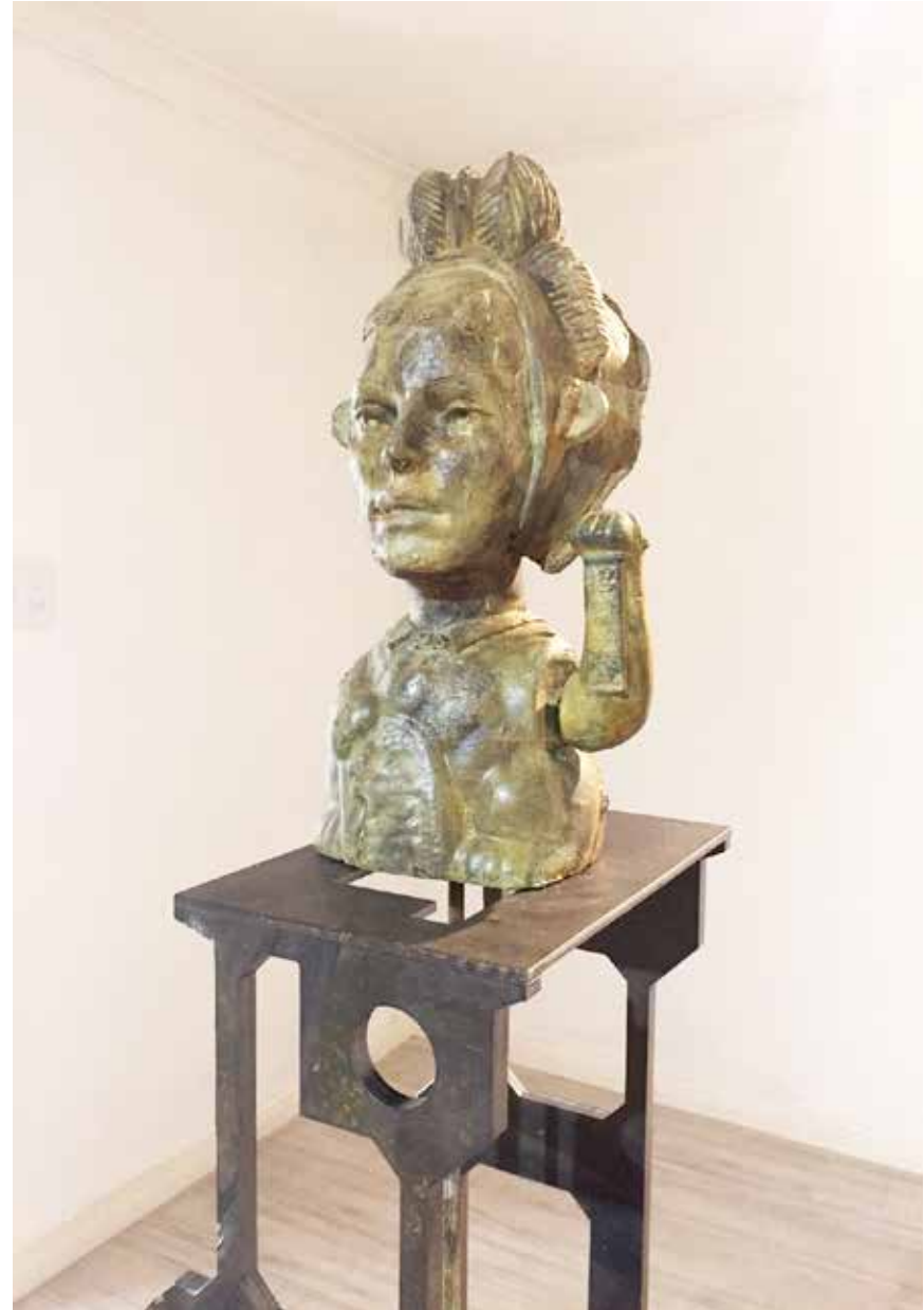
Fortune Cat III , Bronze and Steel, Edition 2 of 7, 2017. Base: 47cm x 31cm x 28cm. Height 152cm.