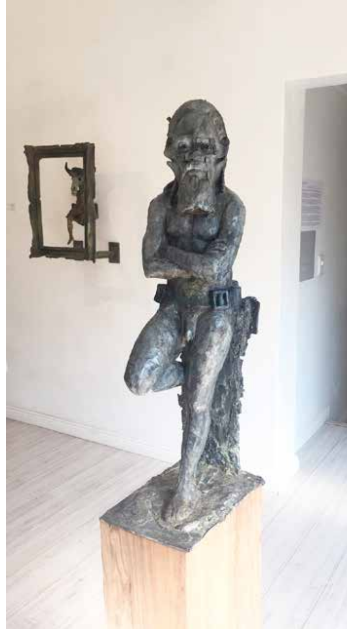
Westcoast Diver (VONO series) , Bronze, wood and concrete, 2017, Base: 21 x 30 x 90 cm. Figure: 21 x 30 x 78 cm