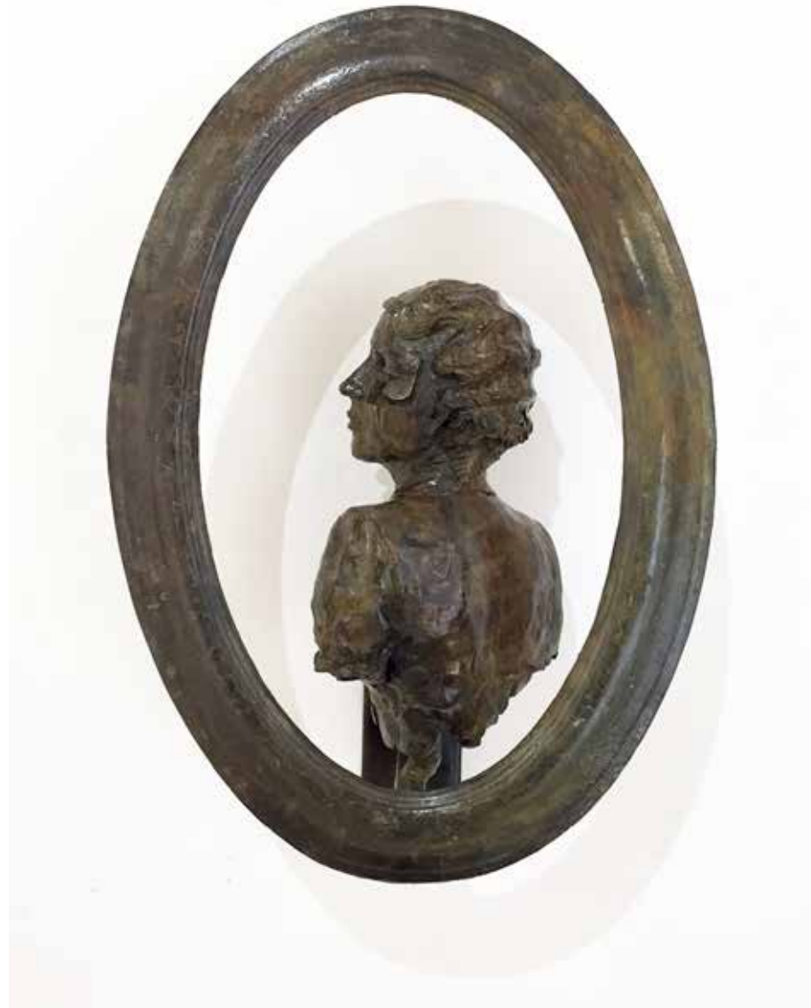
A once beautiful woman (VONO series) , Bronze, 2017, 32cm (width) x 57cm (height) x 20cm (depth).