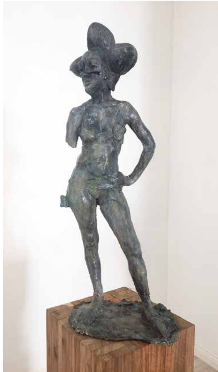
The Divers girlfriend (VONO series) , Bronze, wood and concrete, 2017, Base: 30 x 30 x 90 cm. Figure: 22 x 30 x 80 cm.