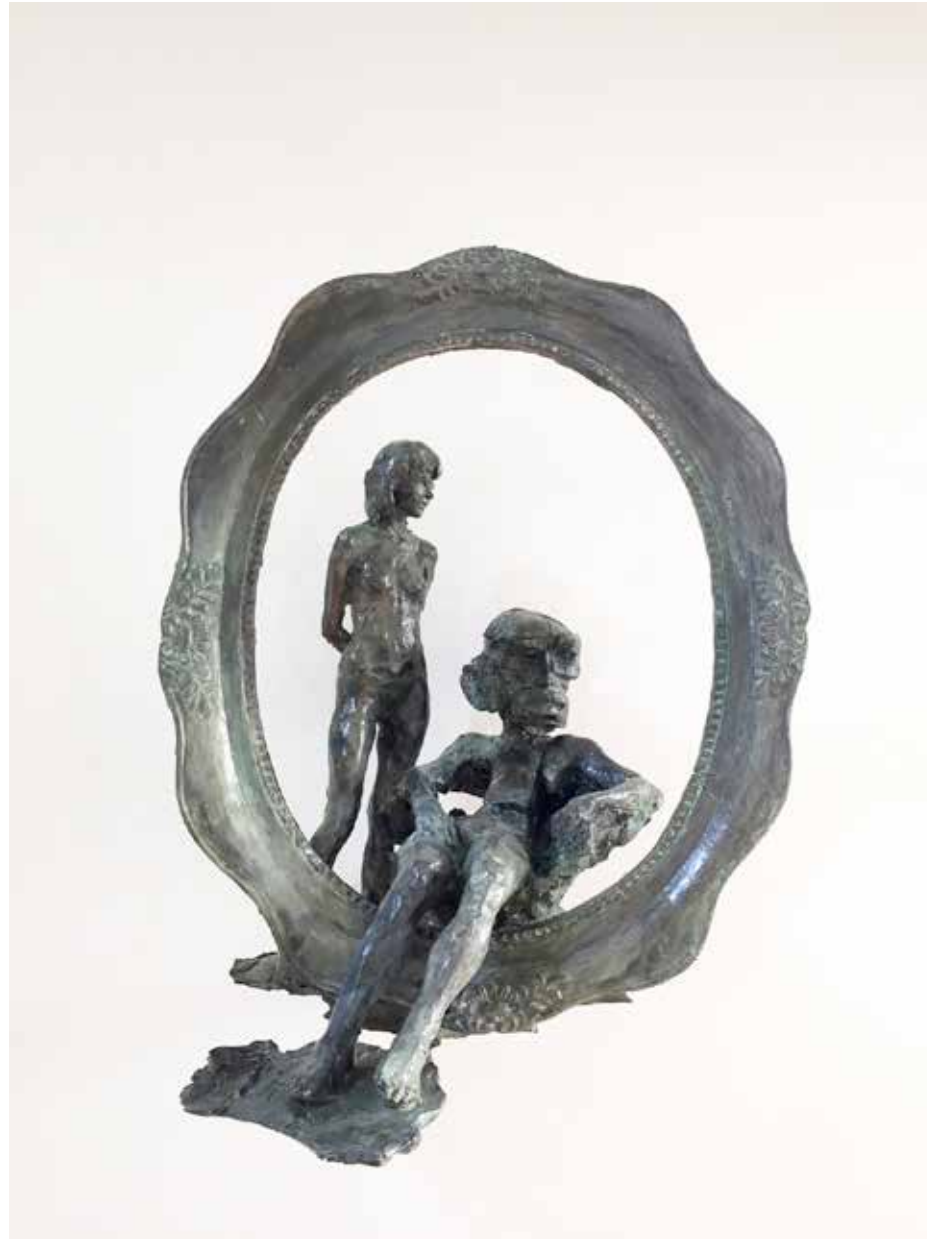
A married couple (VONO series) , Bronze, 2017, 40cm (width) x 53cm (height) x 43cm (depth).