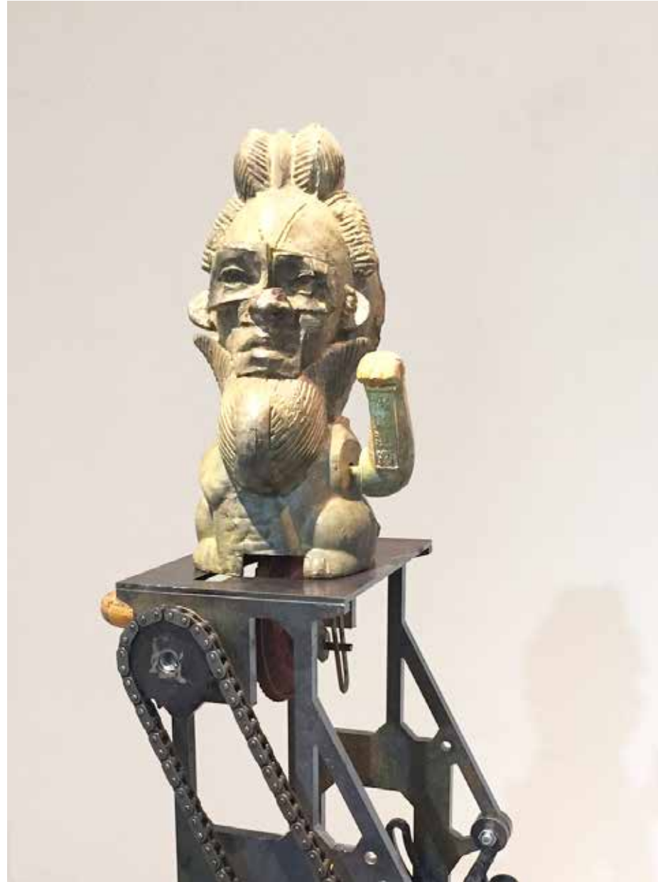
Fortune Cat II , Bronze and Steel, Edition 2 of 7, 2017. Base: 47cm x 31cm x 28cm. Height 152cm.