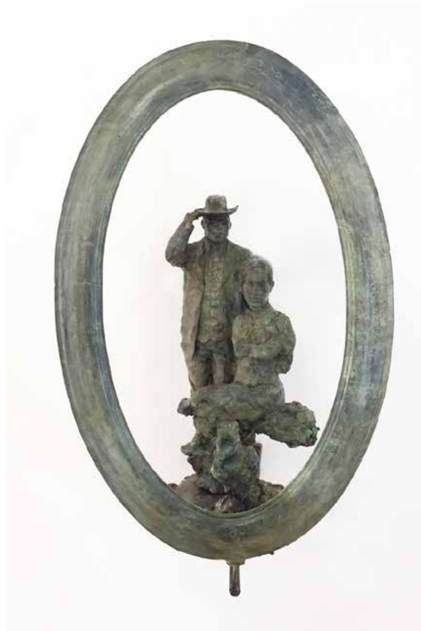
Important visitors (VONO series) , Bronze, 2017, 40cm (width) x 63cm (height) x 31cm (depth).