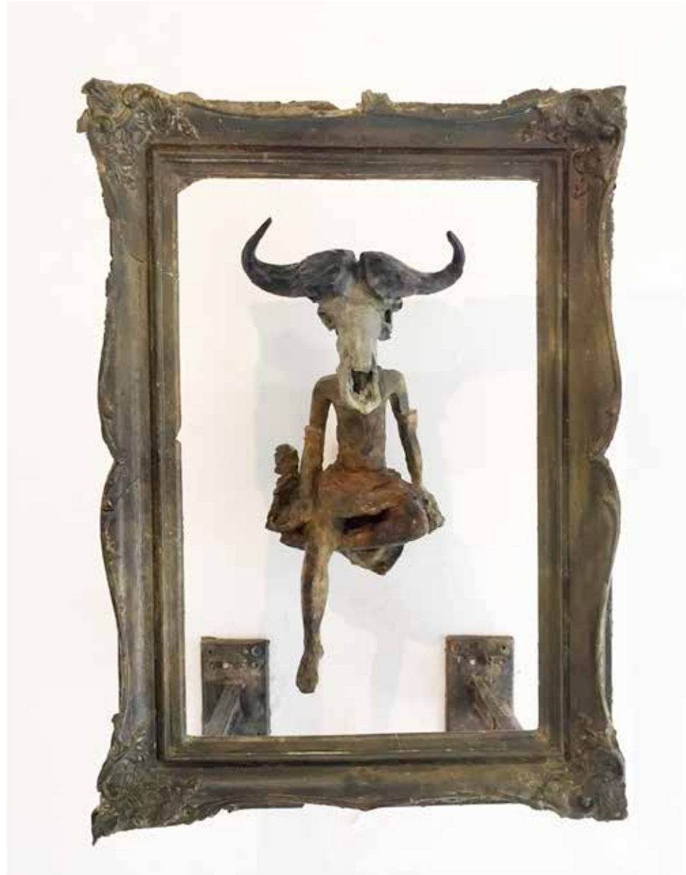
The mayors daughter (VONO series), Bronze, 2017, 47cm (width) x 62cm (height) x 31cm (depth).