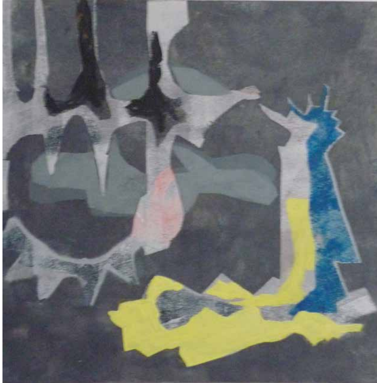
RB SS Cirrus 16 , 2016, Acrylic on board, 20 x 20 cm