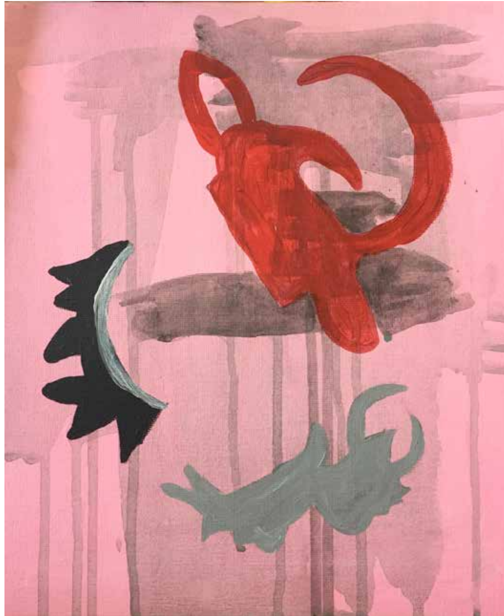
RBS Cirrus 16 , 2017, Acrylic on board 30 x 25 cm Framed