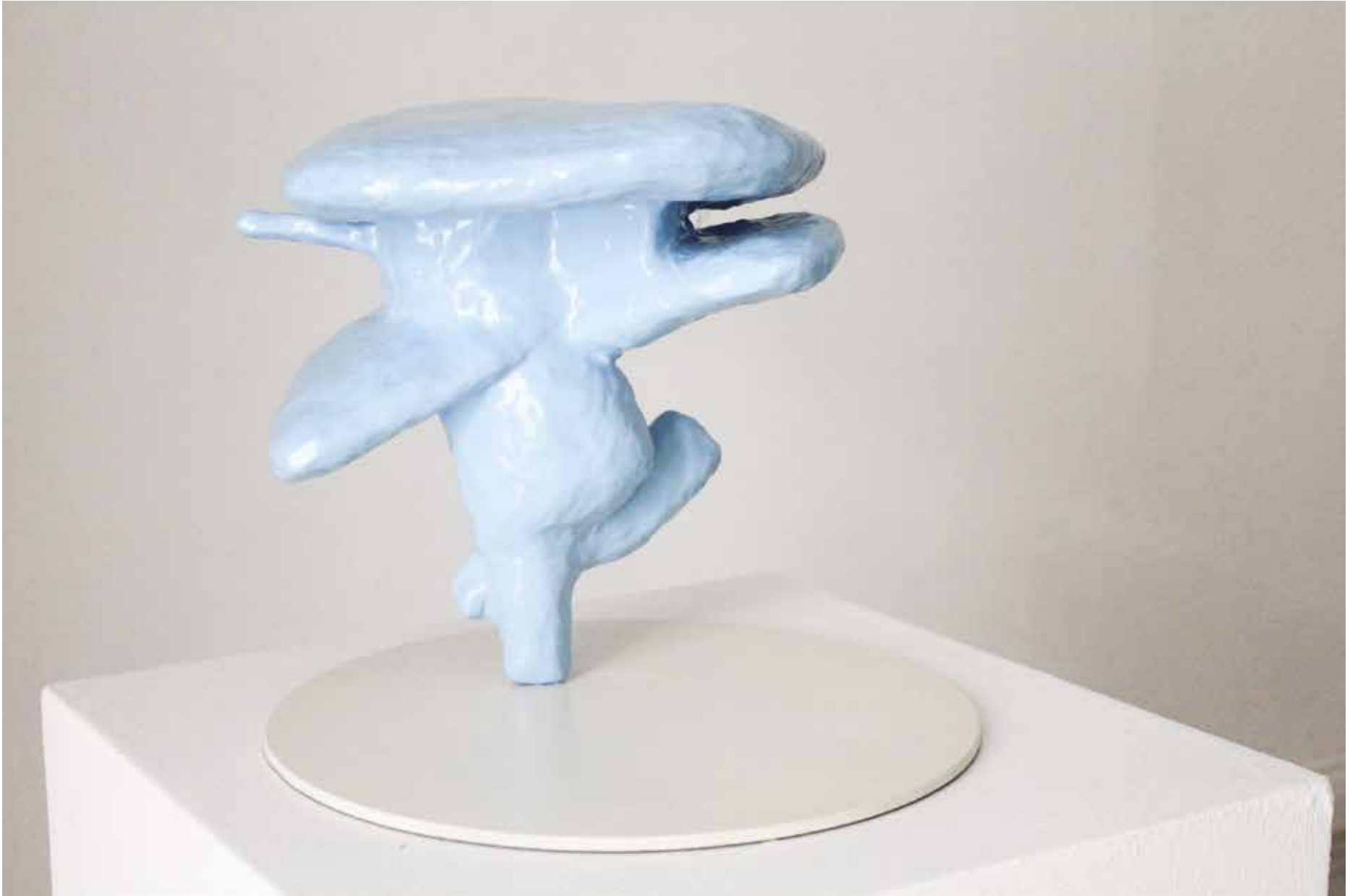
Princess Cirrus.85 , Fibreglass, steel & automotive paint paint, 2016, 25 x 25 x 24 cm