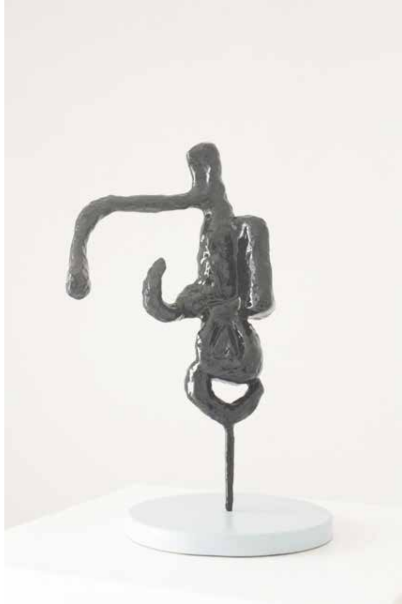
AR Cirrus 16 , Fibreglass, steel & automotive paint, 39 x 21 x 12 cm