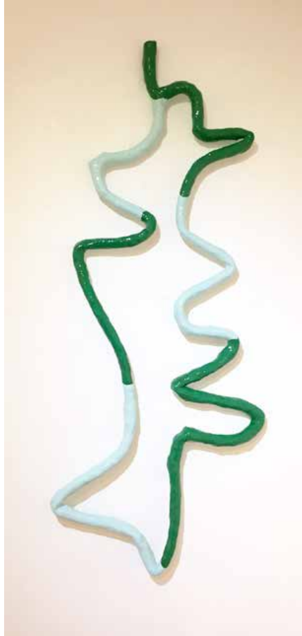
M Cirrus 17 , Fibreglass & automotive paint, 104 x 47 x 3cm, 2017