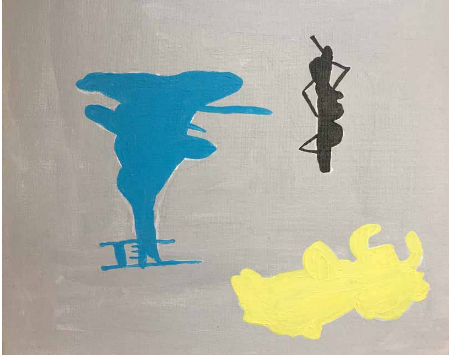
PSO Cirrus 16 , 2016, Acrylic on board, 25 x 30 cm Framed