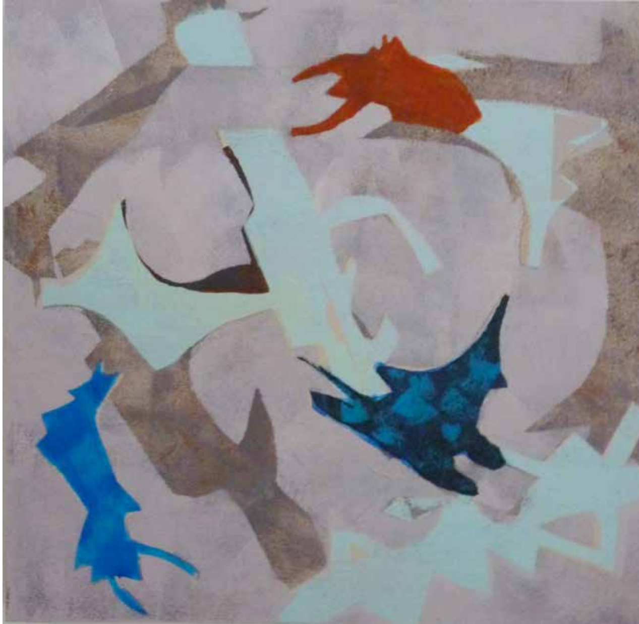
ARP Cirrus 16 , 2016, Acrylic on board, 20 x 20 cm