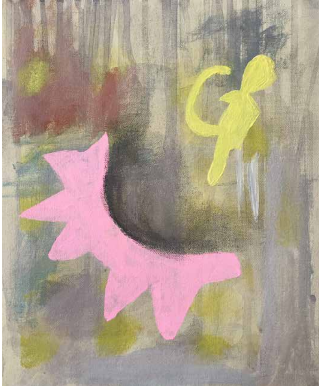
RB Cirrus 16 , 2016, Acrylic and Charcoal on board, 30 x 25 cm, Framed