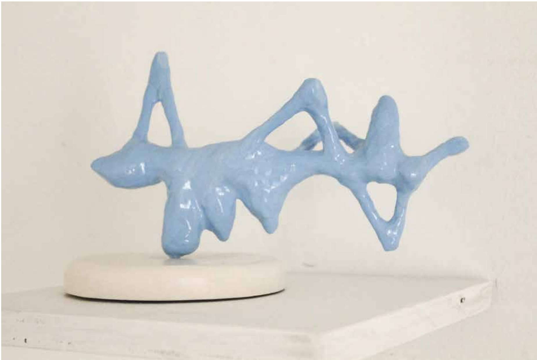
O Cirrus 2.16 , Fibreglass, steel & automotive paint, 15 x 23.5 x 7cm