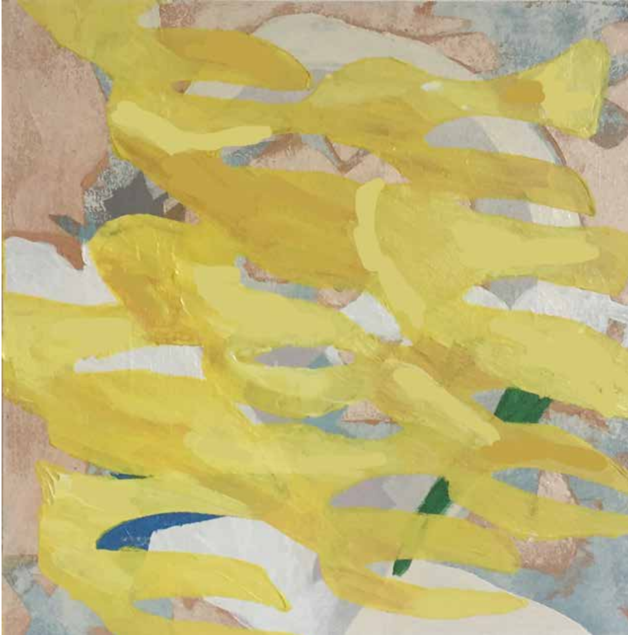
CH Cirrus 16 , 2016, Acrylic on board, 20 x 20 cm