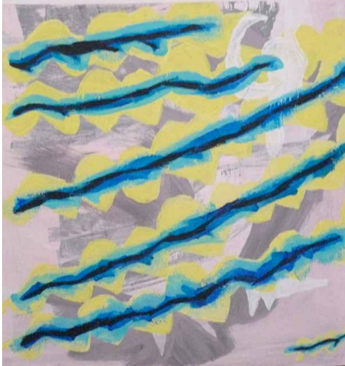
CHA Cirrus 16 , 2016, Acrylic on board, 20 x 20 cm