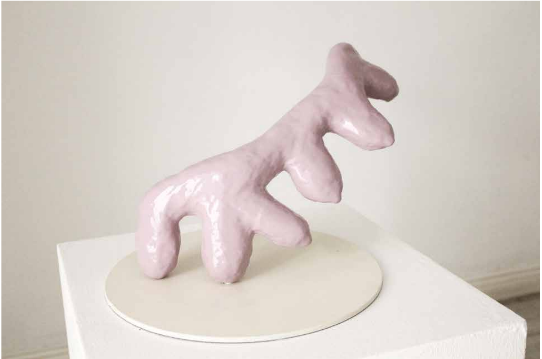
BIB 10.20.15 , Fibreglass, steel & automotive paint 24 x 30 x 18 cm