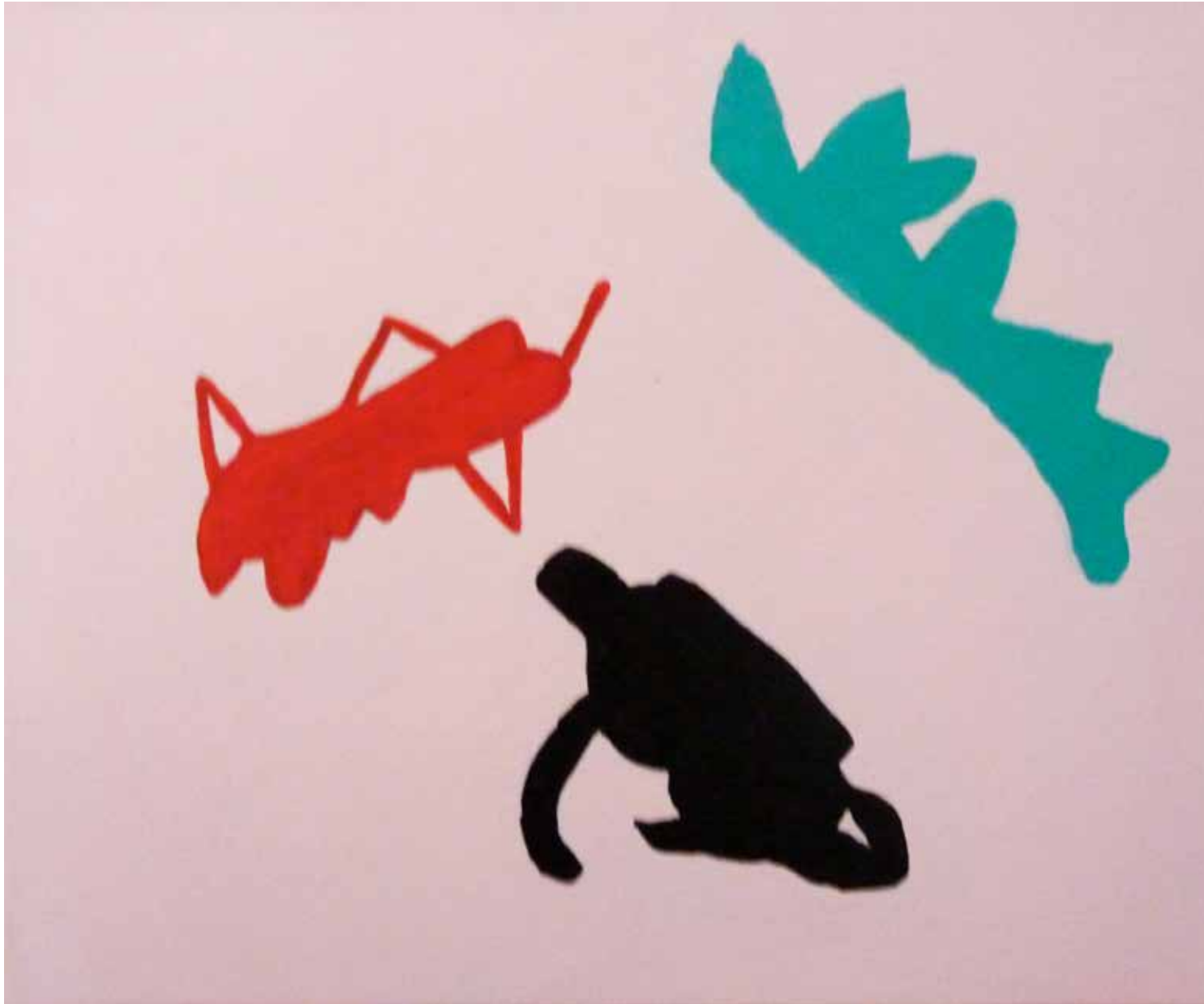
GBIBAR Cirrus 16 , 2016, Acrylic on board, 30 x 25 cm, Framed