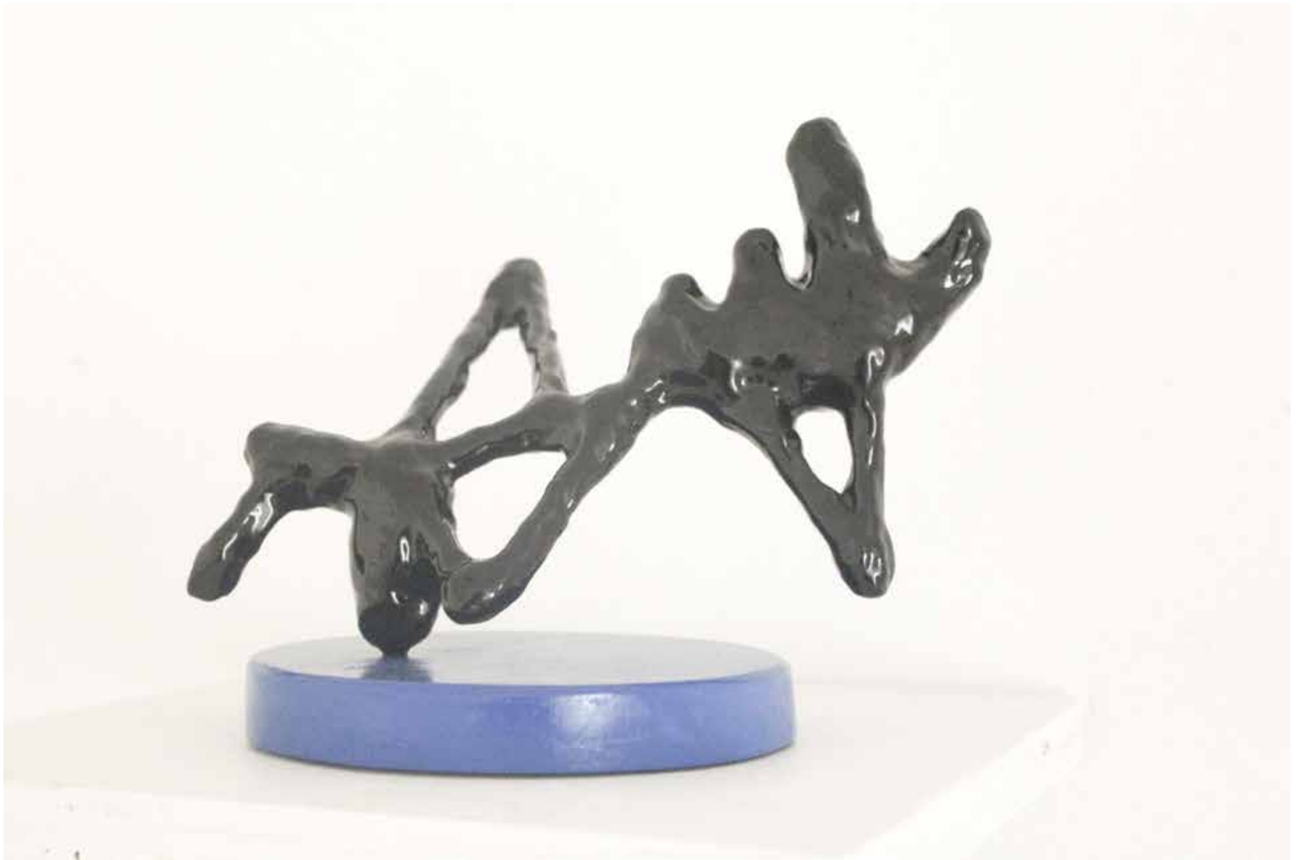
OU Cirrus 02.16 , Fibreglass, steel & automotive paint, 15 x 21 x 12 cm