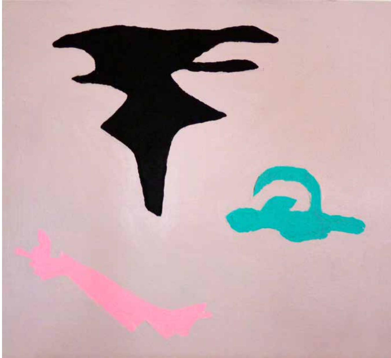
RP Cirrus 16 , 2016, Acrylic on board, 30.5 x 30.5 cm