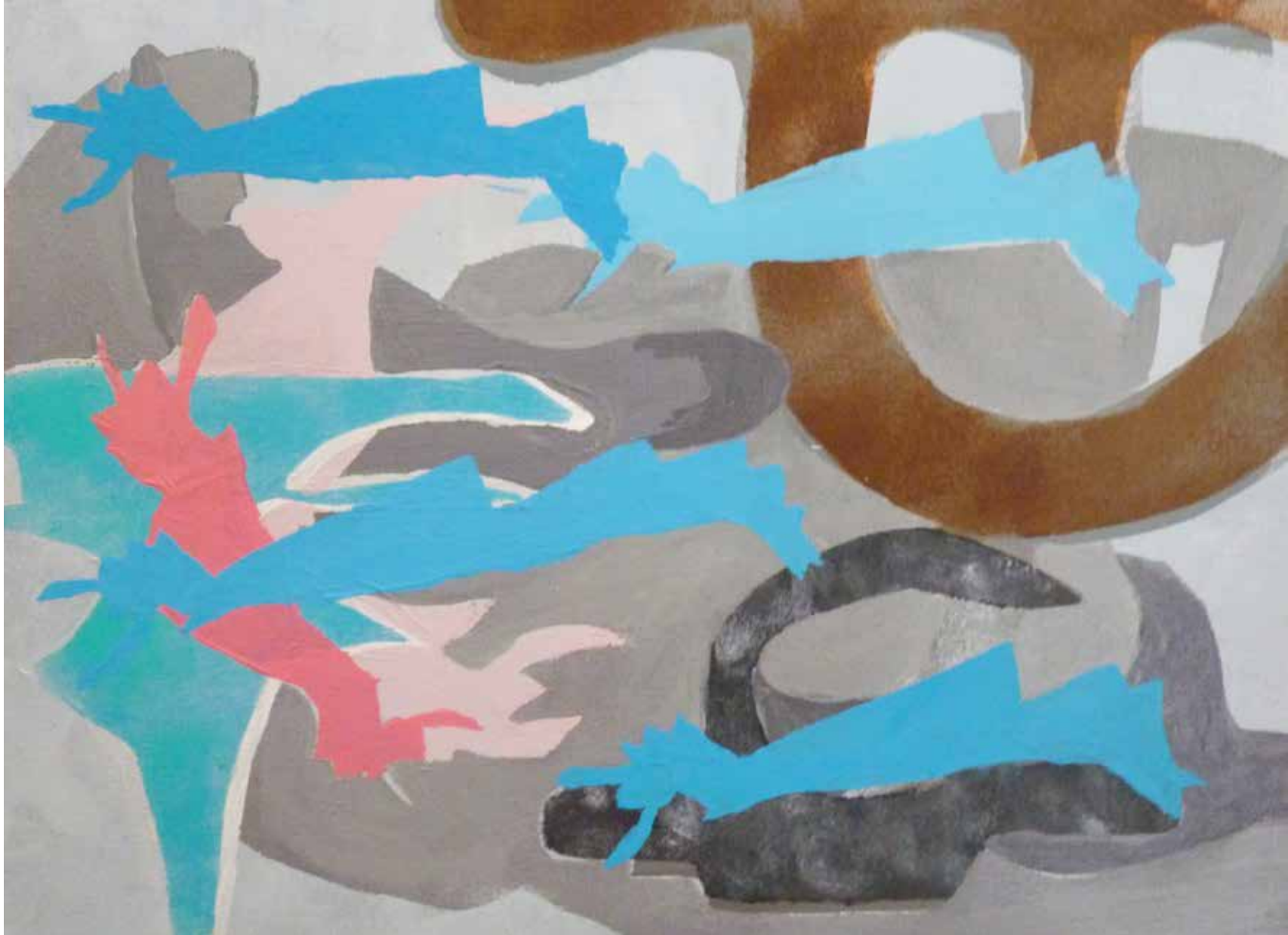
PAR Cirrus 16 , 2016, Acrylic on board, 23.3 x 31.5 cm