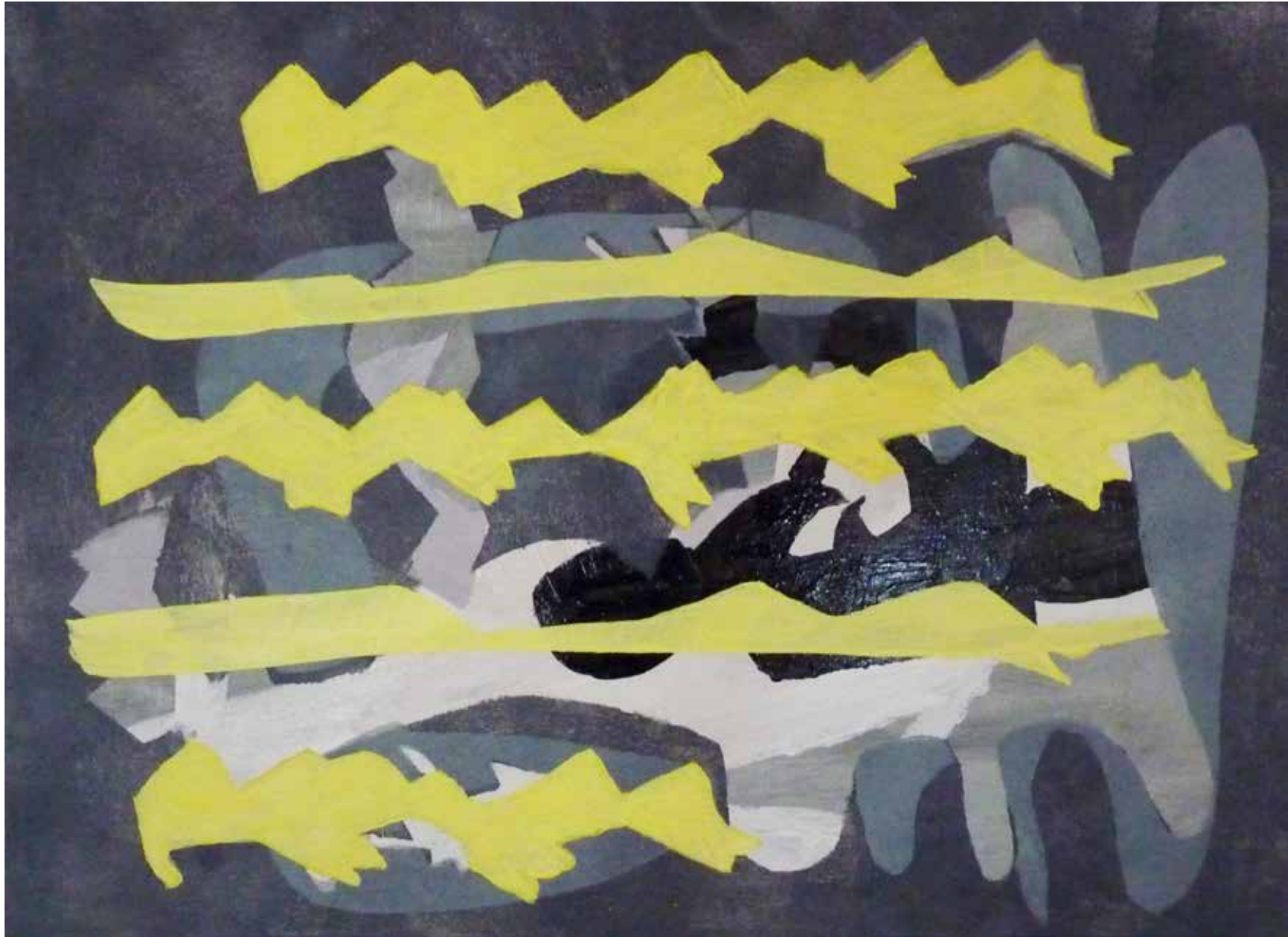
AR Stratus 16 , 2016, Acrylic on board, 23.3 x 31.5 cm