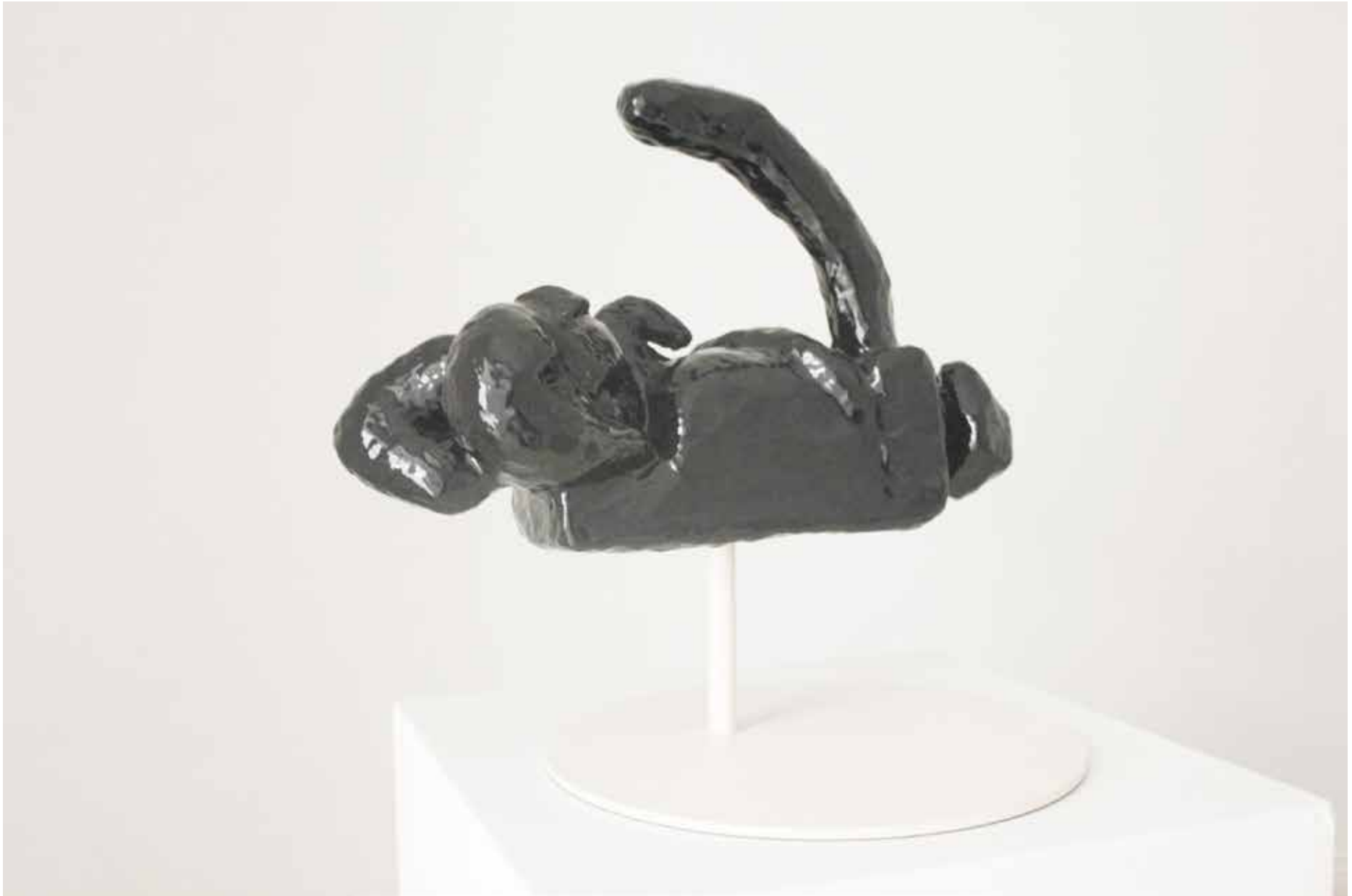
Armchair revolution Cirrus.86 , Fibreglass, steel & automotive paint, 2016, 38x38x15 cm