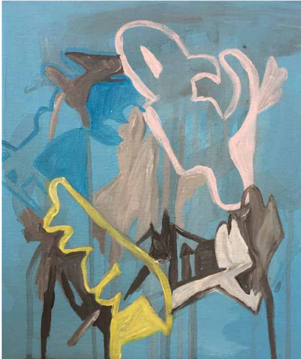
RBB Cirrus 16 , 2016, Acrylic on board, 30 x 23cm, Framed