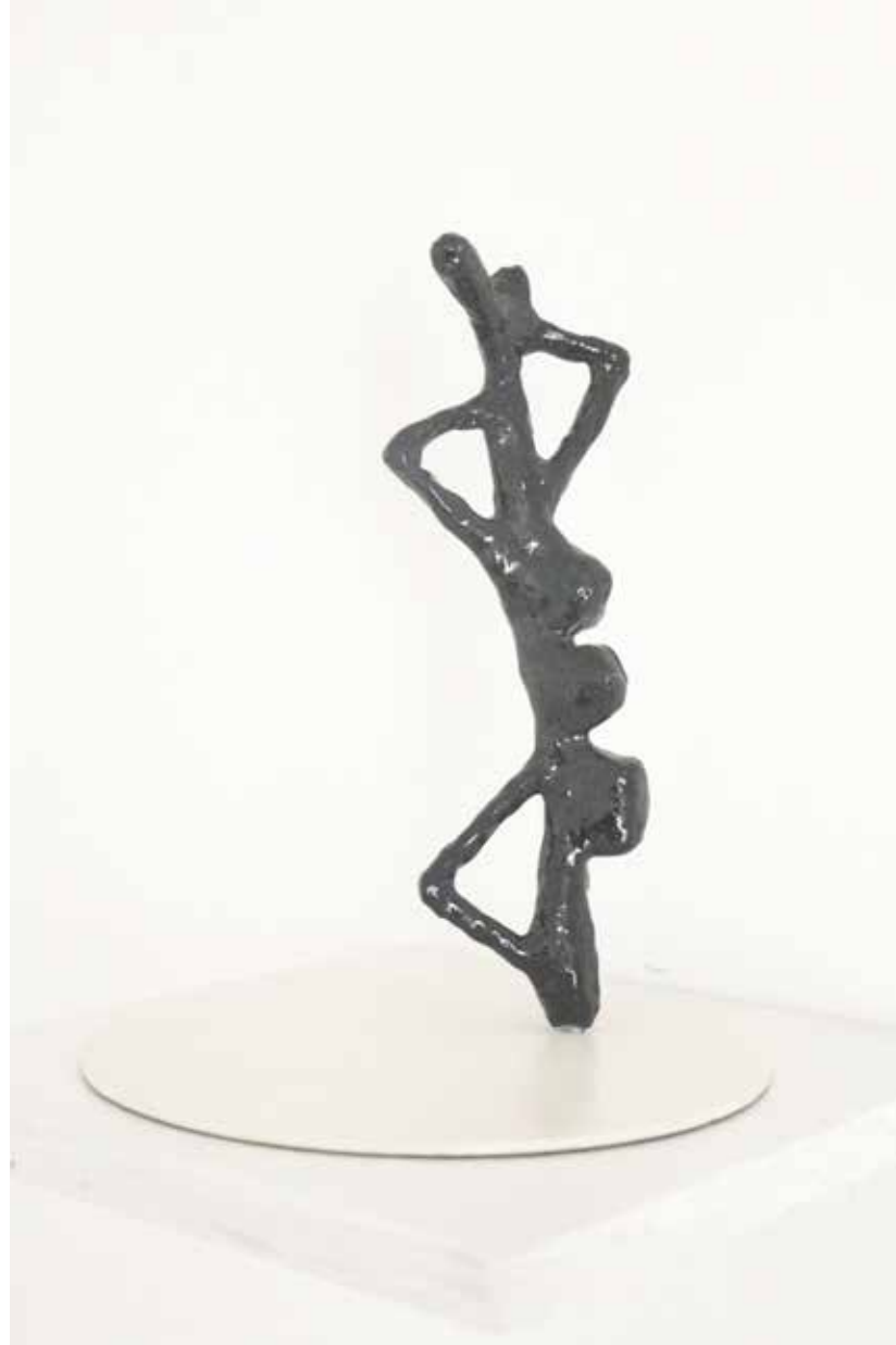
OUP Cirrus 02.16 , Fibreglass, steel & automotive paint 24 x 8 x 5 cm