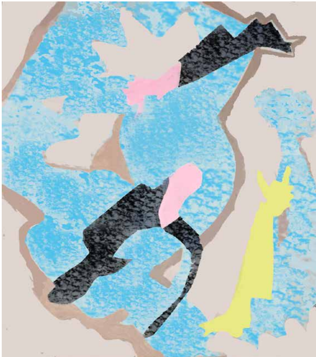
AR Cirrus 16 , 2016, Acrylic on board, 30 x 25 cm, Framed