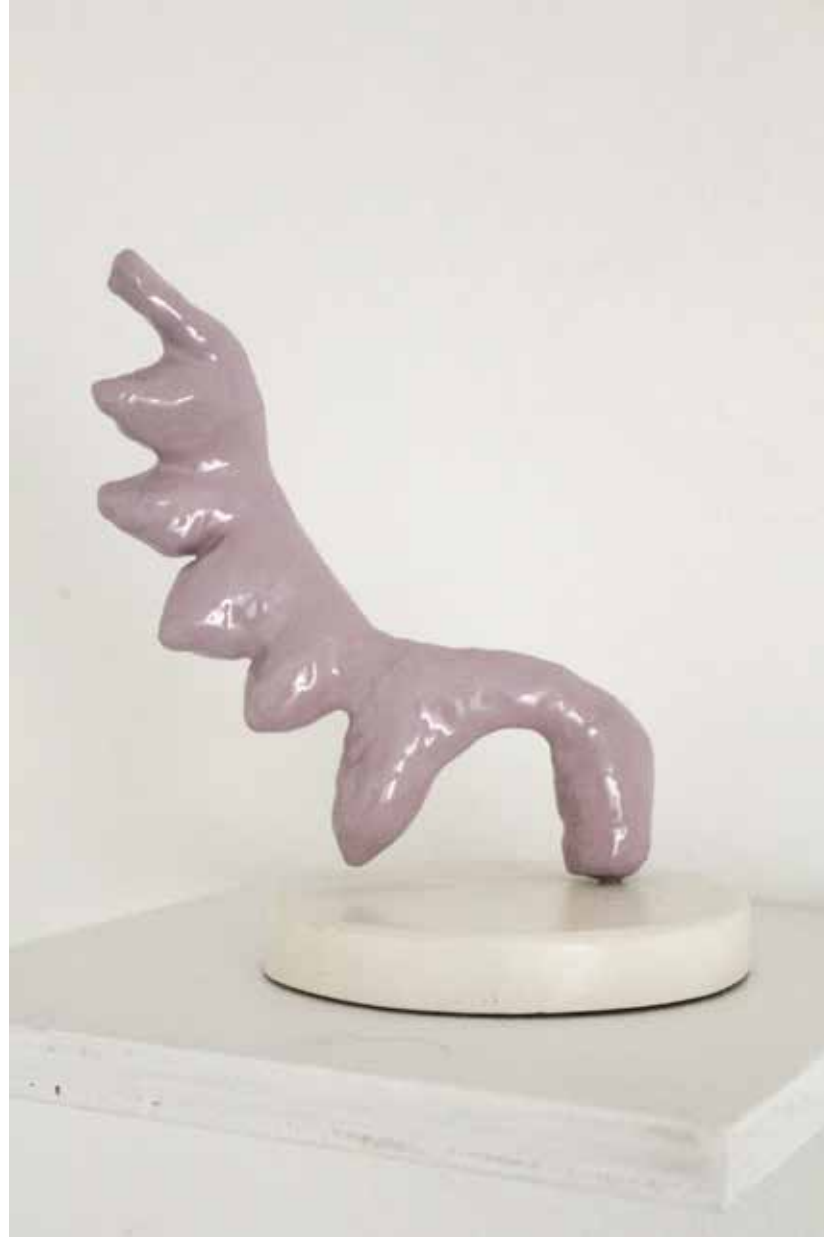
BIBs 10.20.15 , Fibreglass, steel & automotive, 19 x 16 x 4 cm