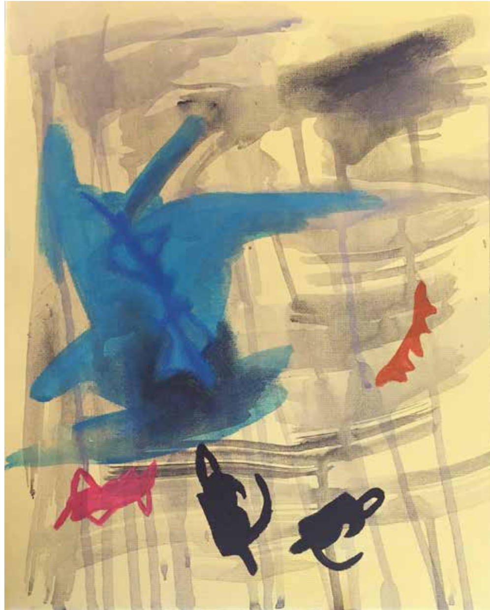
BOR Cirrus 16 , 2016, Acrylic and Charcoal on board, 30 x 25 cm