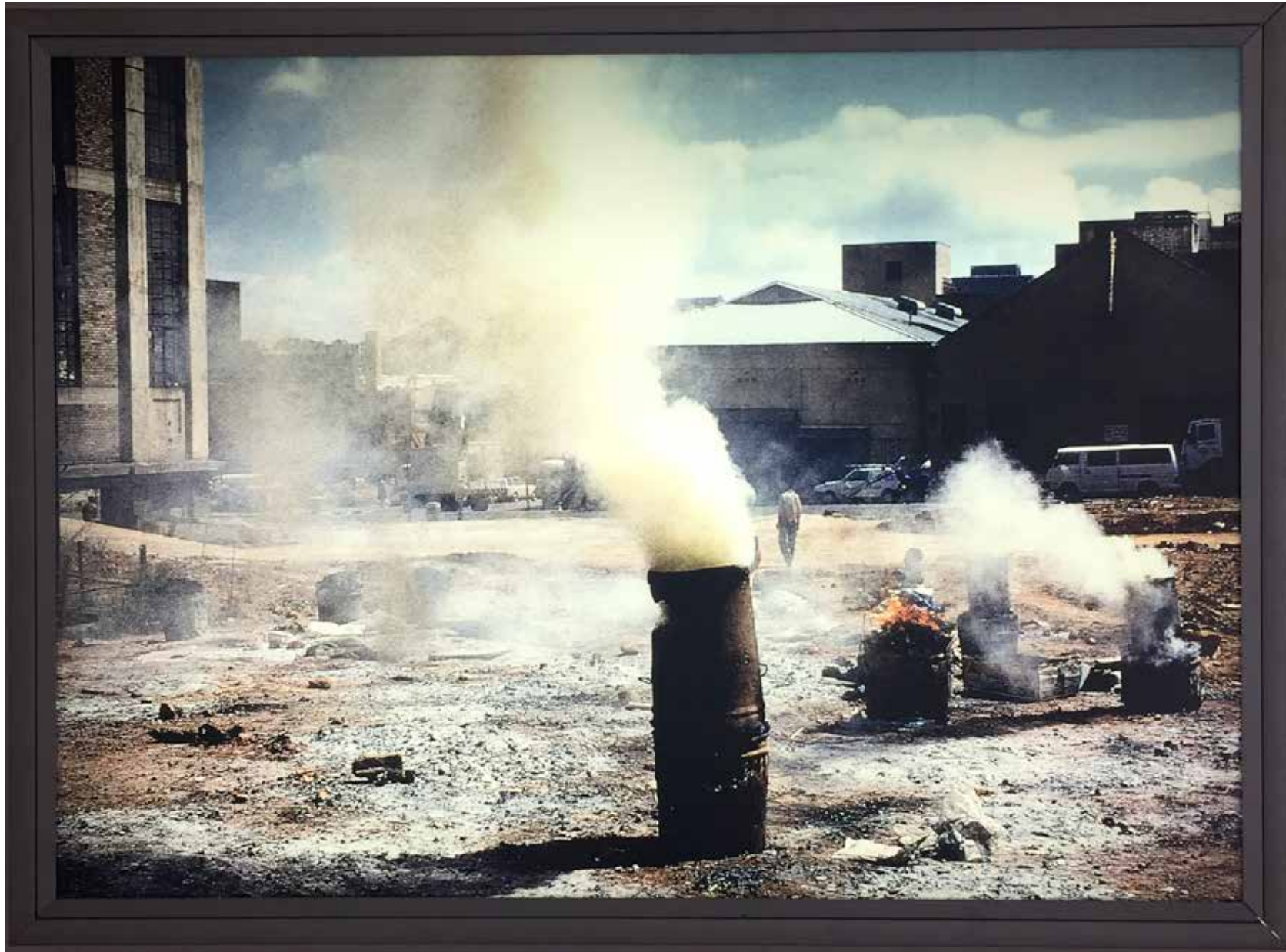
Scene from Newtown , Aluminium framed Lightbox, 93 x 127 x 11 cm, 1997.