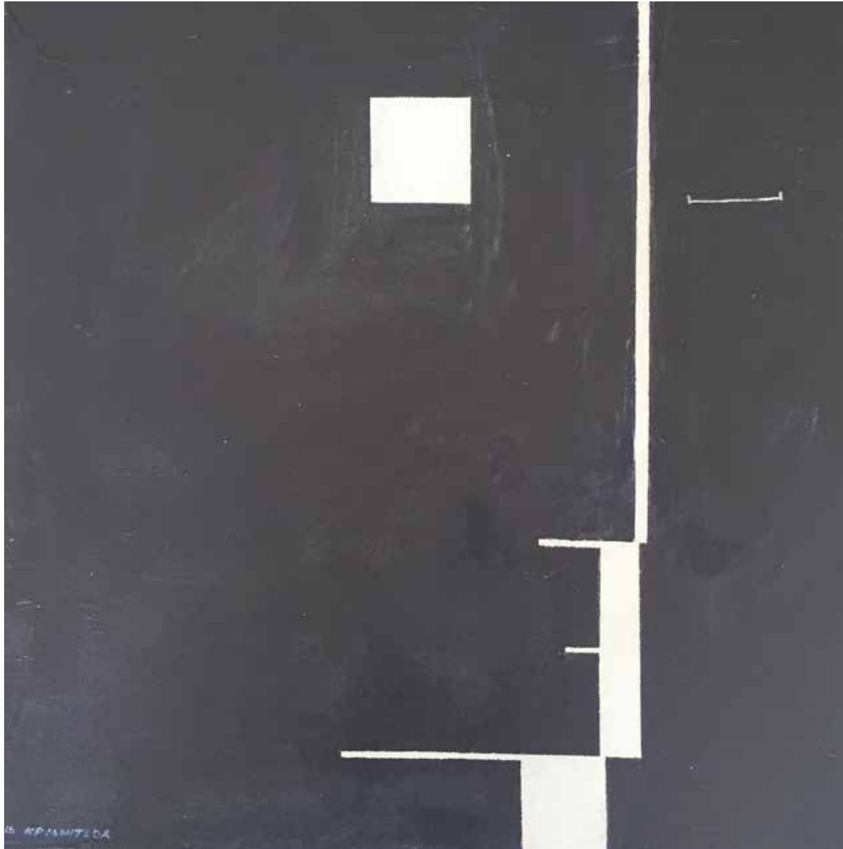
Wink , Acrylic on canvas, 50 x 50 cm, 2016.