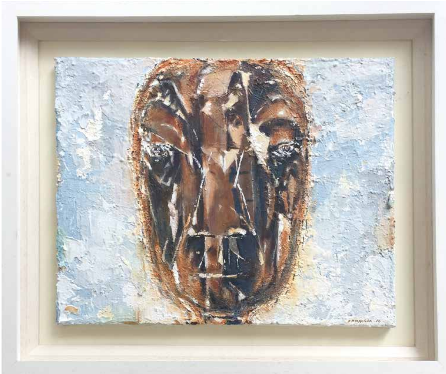
Mask , Acrylic on canvas, Framed, 55,5 x 65,5 cm, 2016.