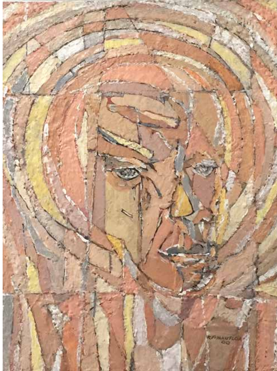
Portrait with a halo , Acrylic on canvas, 40,5 x 30,5 cm, 2000.