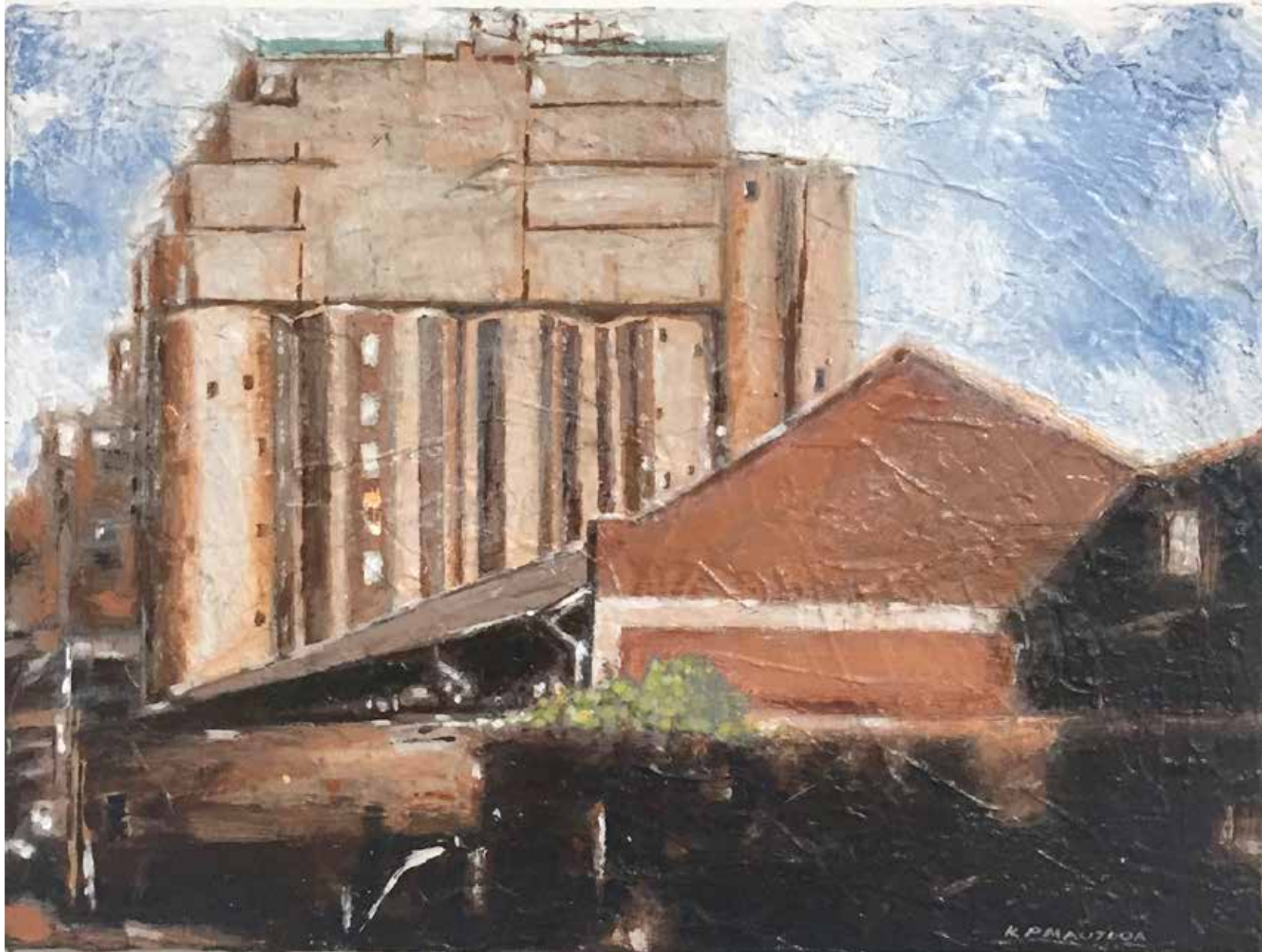
Silos in Newtown , Acrylic on canvas, 30,5 x 41 cm, 1999.