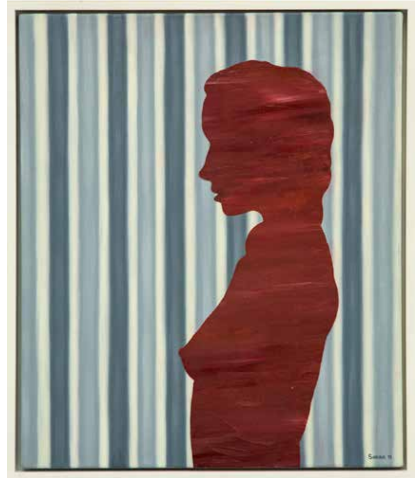
Sotiris Moldovanos, Murmur , Oil on canvas, 63 x 53 cm, 2016. R16,000.