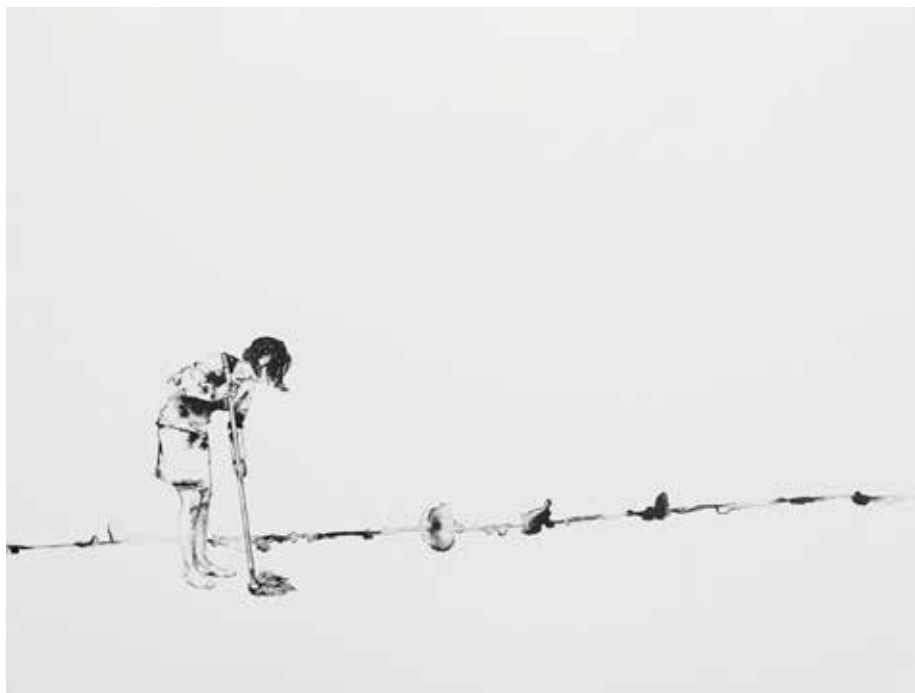
Usha Seejarim, A philosophy of habit , Lithograph, Edition of 11, 66 x 50 cm, 2016. R5,000 (unframed)