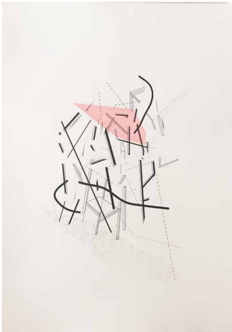
Maaïke Bakker, All possible scenarios II , 2 colour screenprint on Fabriano, 70 x 50 cm, Edition of 10, 2016, R3200.(unframed)