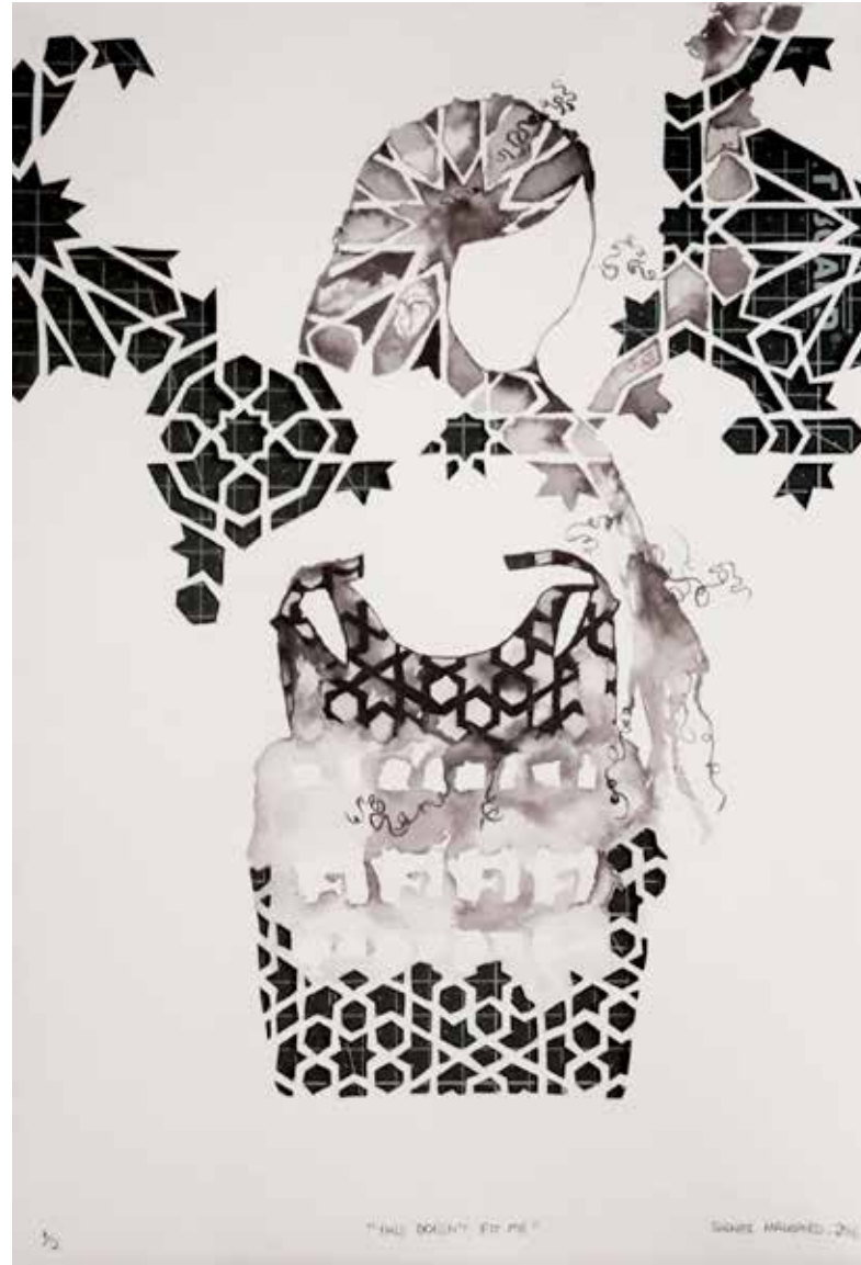
Shenaz Mahomed, This doesn't fit me , Ink and hand paper-cut on Hahnemühle, 39 x 27 cm, Edition 1 of 2. 2016 R3,600 (framed)