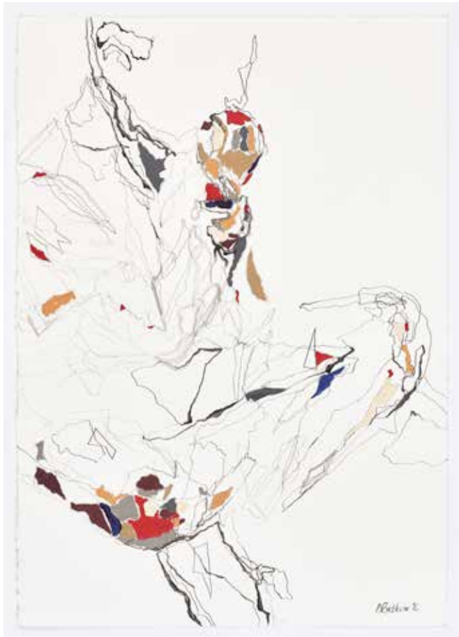
Bev Butkow, Implosion I: An unsubtle process of disintegration? Indian ink & graphite on fabriano, 50 x 35 cm, 2016. R9,000 (framed)