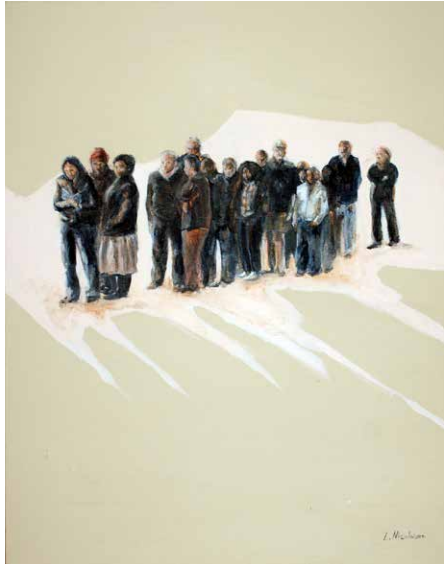
Lelani Nicolaisen, Waiting in line , Acrylic on canvas, 50.5 x 40.5 cm, 2016, R4,000