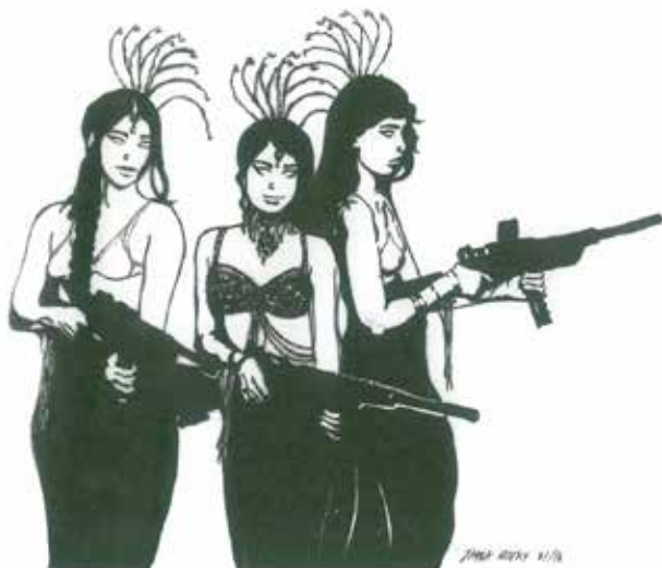
Jayna Mistry, Trinity , Silkscreen print, Edition of 5, 42 x 29.7 cm, 2016. R2000 (framed)