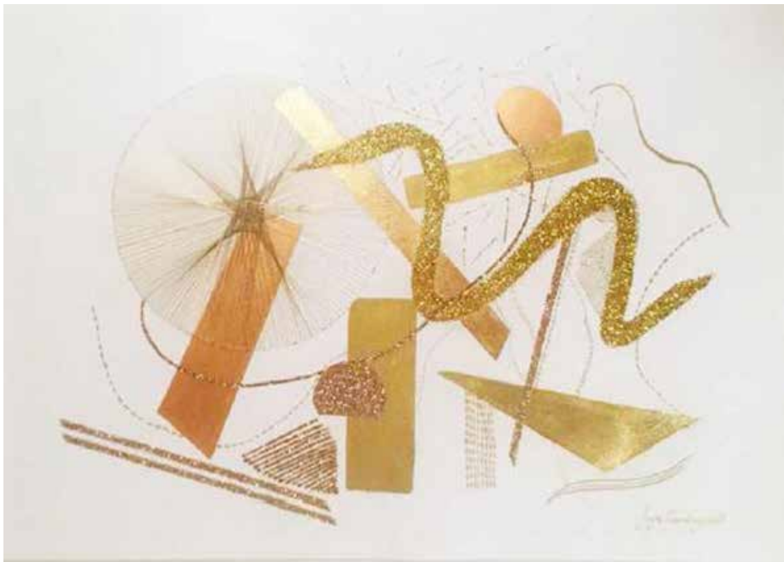
Jayne Crawshay-Hall, Trinkets and trumpery , Glitter & mixed media on fabriano, 75 x 55 cm, 2016. R3,900