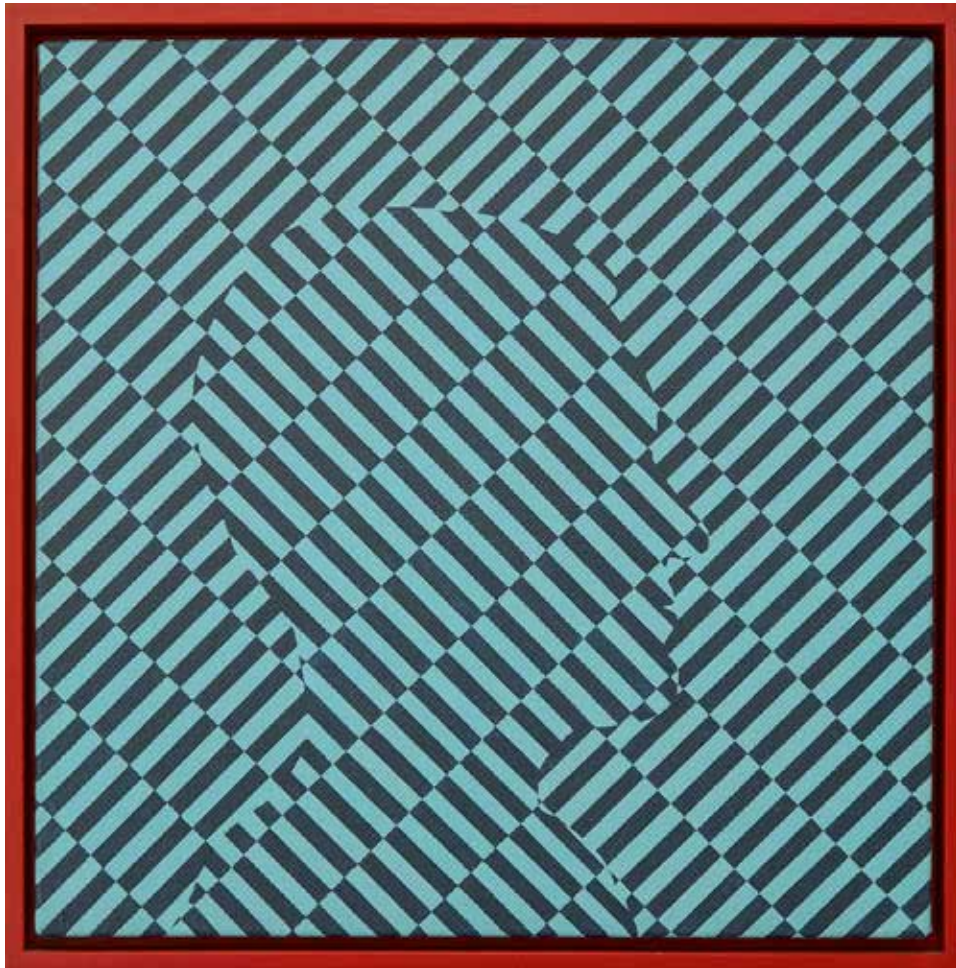
Sotiris Moldovanos, Blue Self-portrait , Enamel on canvas, 53.5 x 53.5 cm, 2016. R14,000