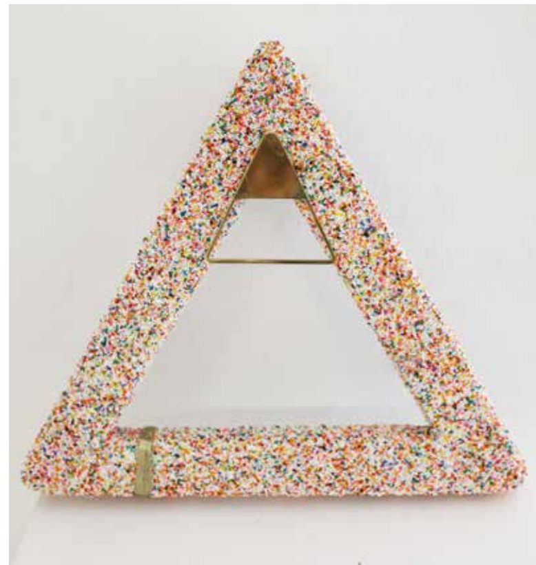
Jayne Crawshay-Hall, 29 , Glitter & mixed media on fabriano, 24 x 24cm, 2016. R2,400