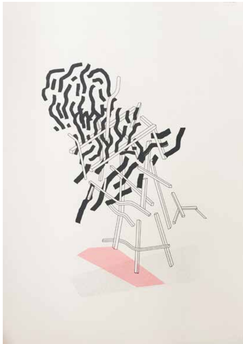
Maaïke Bakker, All possible scenarios I , 2 colour screenprint on Fabriano, 70 x 50 cm, Edition of 10, 2016, R3200. (unframed)