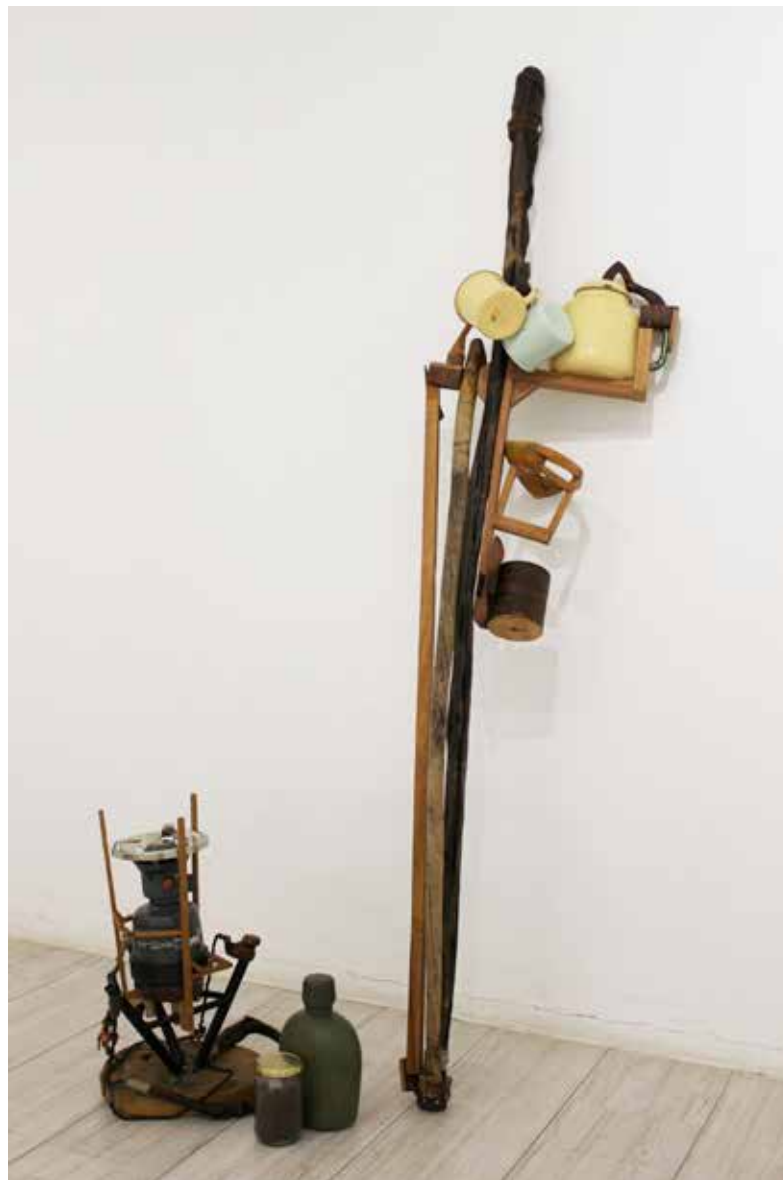
Allen Laing, Coffee Machine , Wood, leather, steel and found objects, Dimensions variable, 2016. R17,800