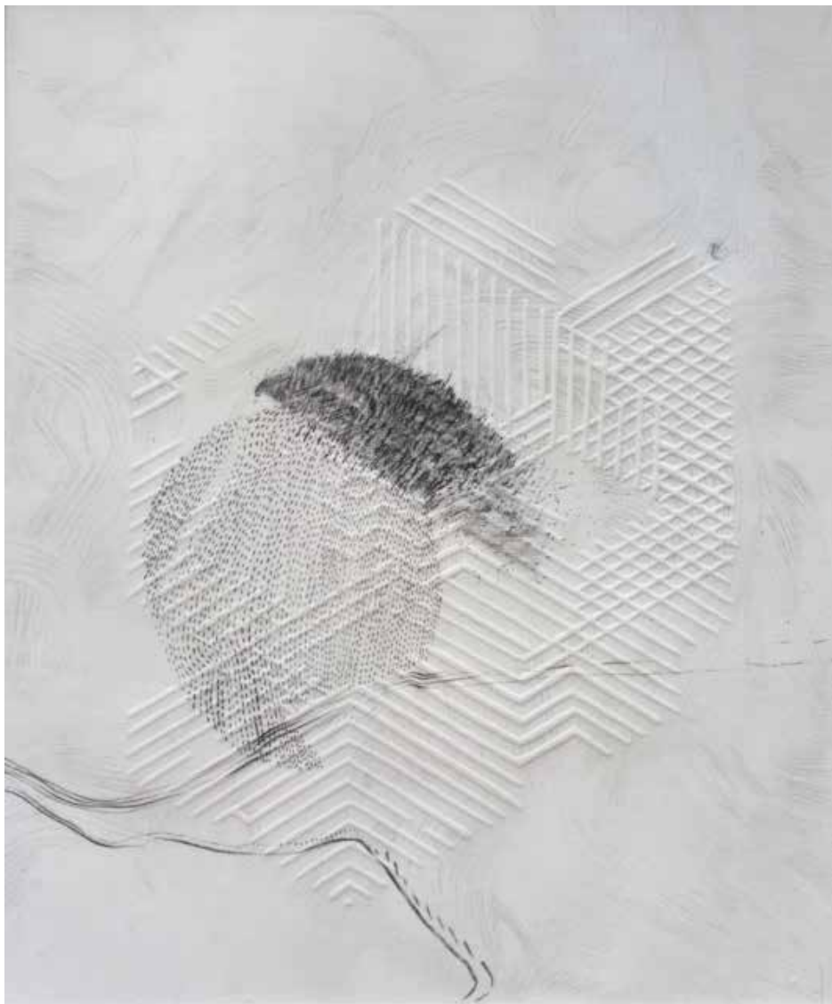
Dalene Victor Meyer, Full stop , Charcoal drawing & blind embossing on fabriano, 35.2x41.5cm, 2016. R4500