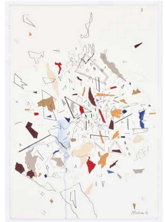
Bev Butkow, Implosion III: An unsubtle process of disintegration? Indian ink & graphite on fabriano, 50 x 35 cm, 2016. R9,000 (framed)