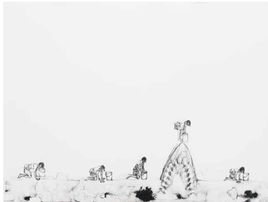
Usha Seejarim, An unlikely state of peace , Lithograph, Edition of 11, 66 x 50 cm, 2016. R5,000 (unframed)