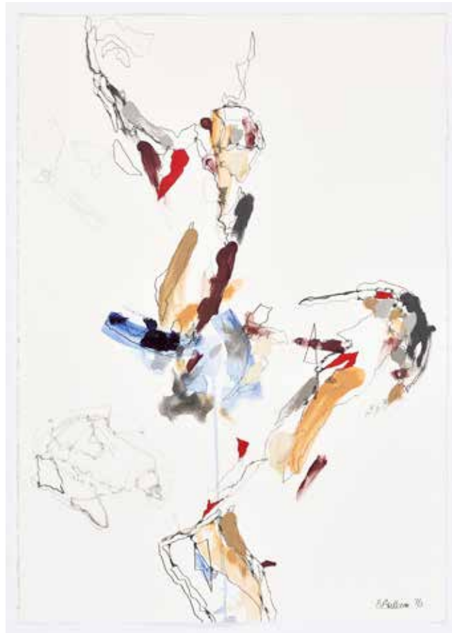
Bev Butkow, Implosion II: An unsubtle process of disintegration? Indian ink & graphite on fabriano, 50 x 35 cm, 2016. R9,000 (framed)