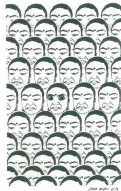
Jayna Mistry, Aunty Stank , Silkscreen print, Edition of 5, 42 x 29.7 cm, 2016. R2000 (framed)