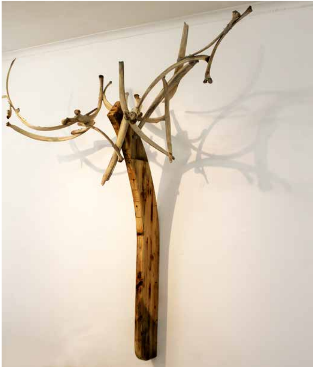
Totem, Wood, cement and ribs. Approx. 110 x 230 cm, Unique, 2016.