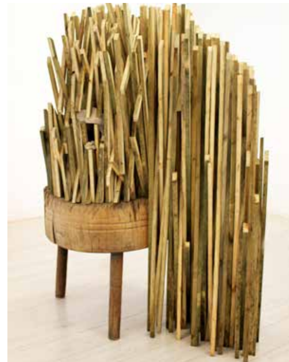
Skulduggery (detail and sideview) , Butchers block, wood, rhino skull and nails. Approx. 135 x 88 x 168 cm, Unique, 2016.