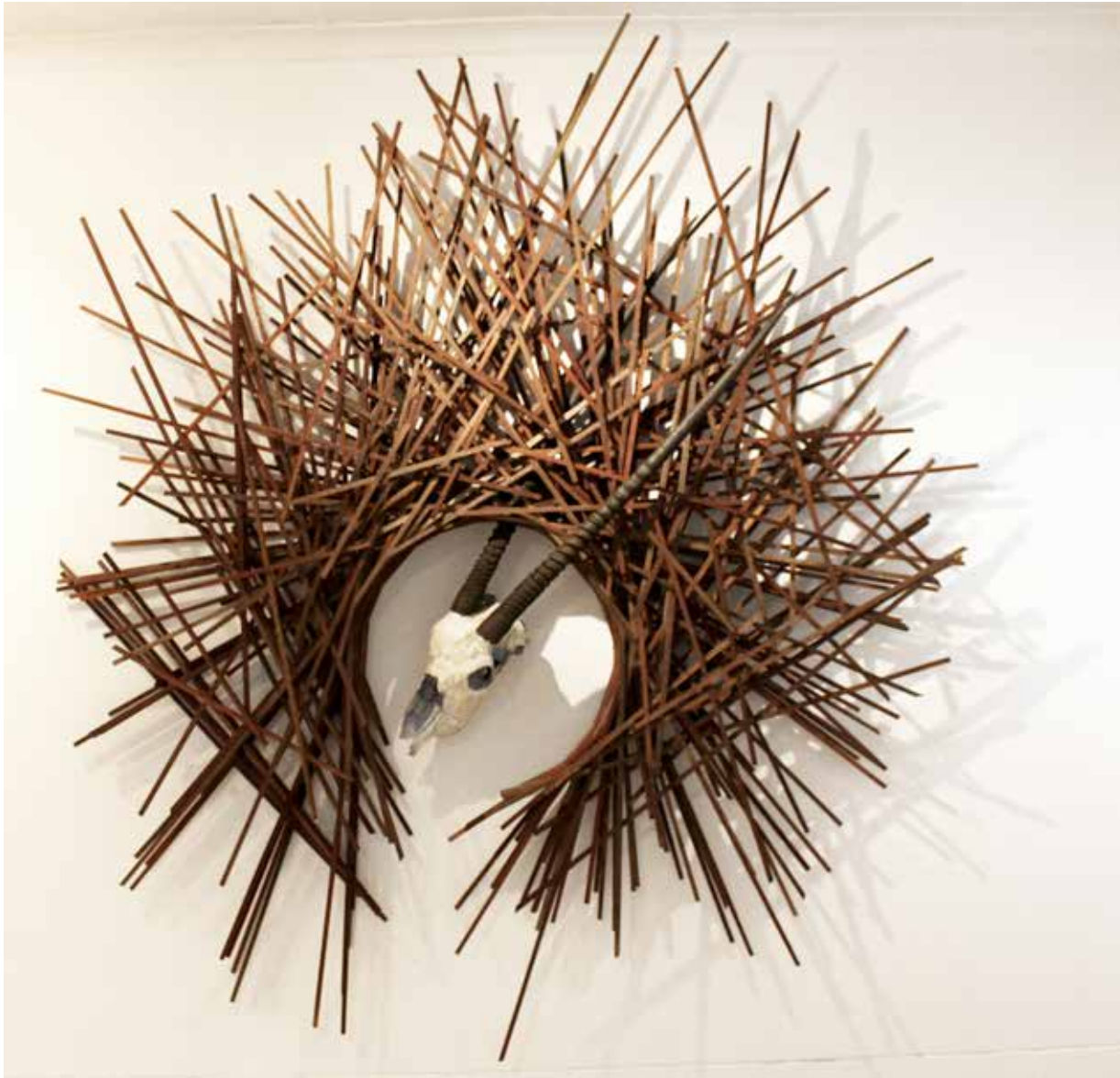
Study for Collapse. Wood, gembok skull and envelope. Approx. 28 x 180 x 200 cm. Unique. 2016.