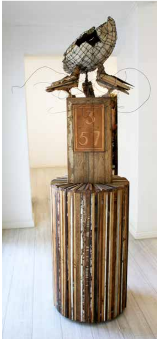
Reverie , Wood, wire and tortoise shell, Approx. 50 x 50 x 200 cm, Unique, 2016.