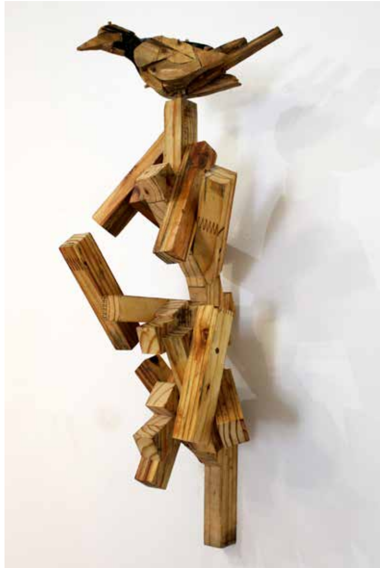
Untitled, Wood. Approx. 28 x 28 x 89 cm, Unique, 2016.