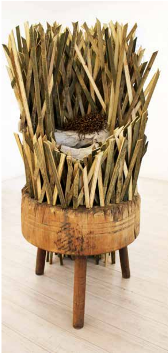
Skulduggery , Butchers block, wood, rhino skull and nails. Approx. 135 x 88 x 168 cm, Unique, 2016.