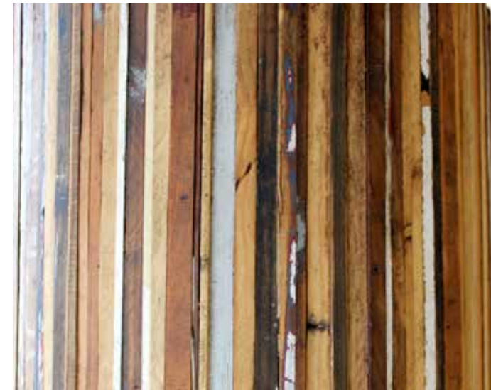
Reverie (detail) , Wood, wire and tortoise shell, Approx. 50 x 50 x 200 cm, Unique, 2016.