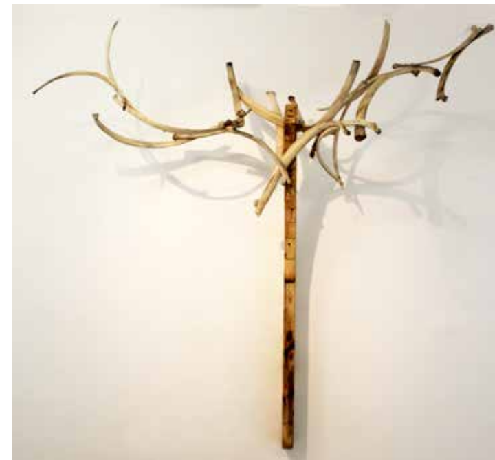
Totem (detail and front view), Wood, cement and ribs. Approx. 110 x 230 cm, Unique, 2016.