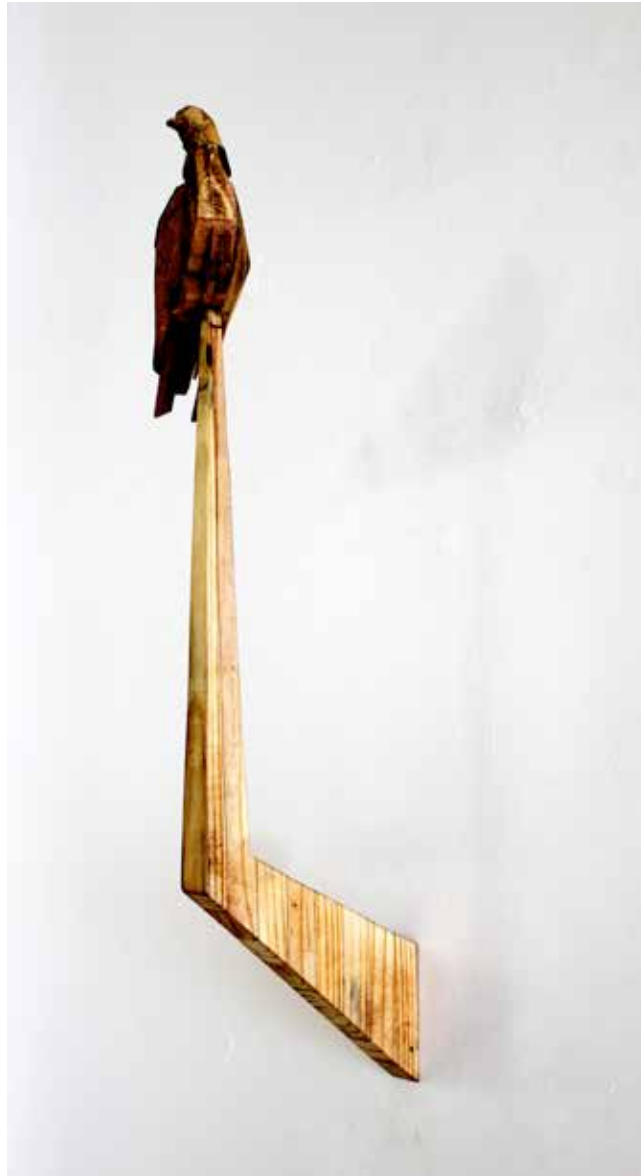
Bird, Wood. Approx. 28 x 29 x 89 cm, Unique, 2016.