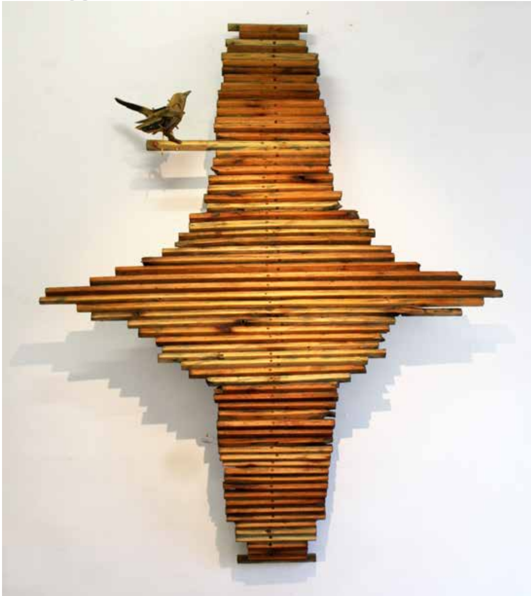
Shield. Wood. Approx. 43 x 169 x 212 cm, Unique, 2016.