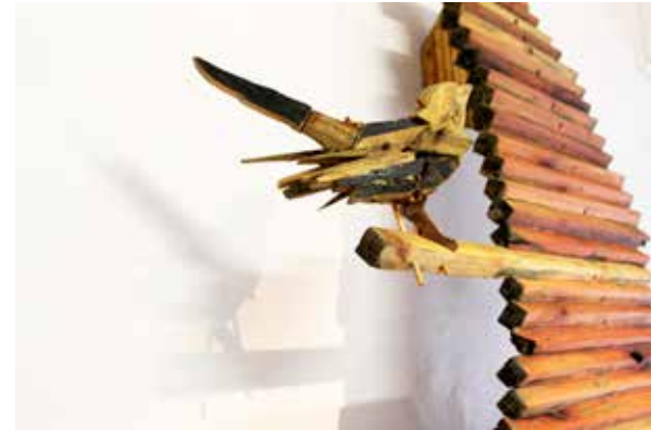
Shield (detail). Wood. Approx. 43 x 169 x 212 cm, Unique, 2016.