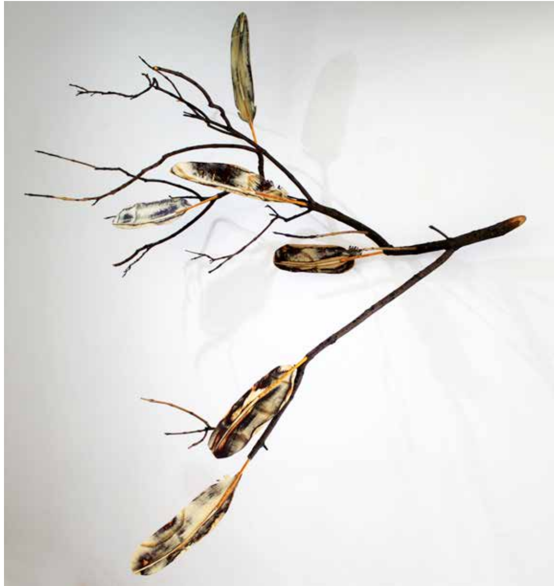
Oar, Wood and pencils. Approx. 60 x 150 x 158 cm, Unique, 2016.