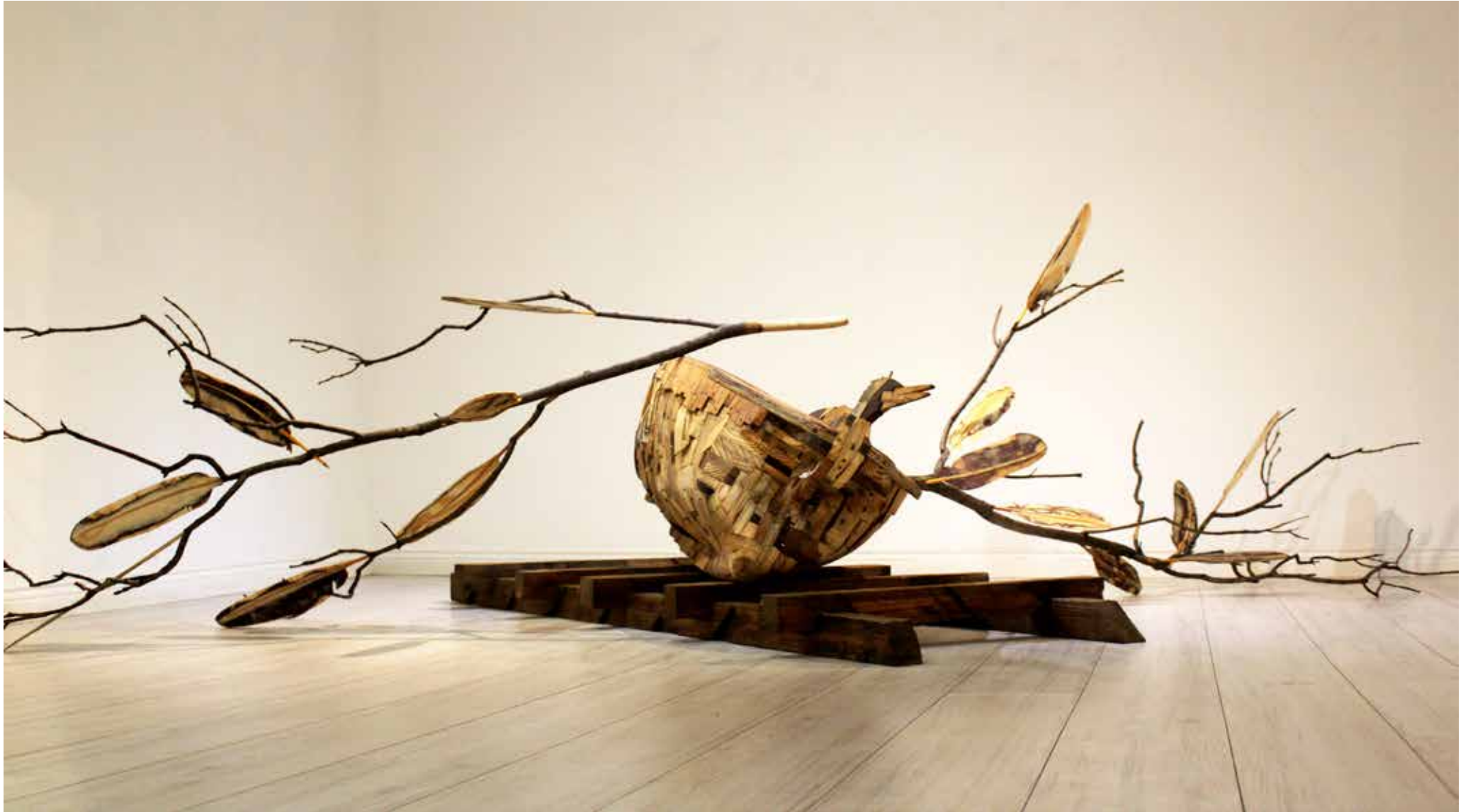
Leaving, Installation – Wood and pencils, Approx. 400 x 200 x 70 cm, Unique, 2016.