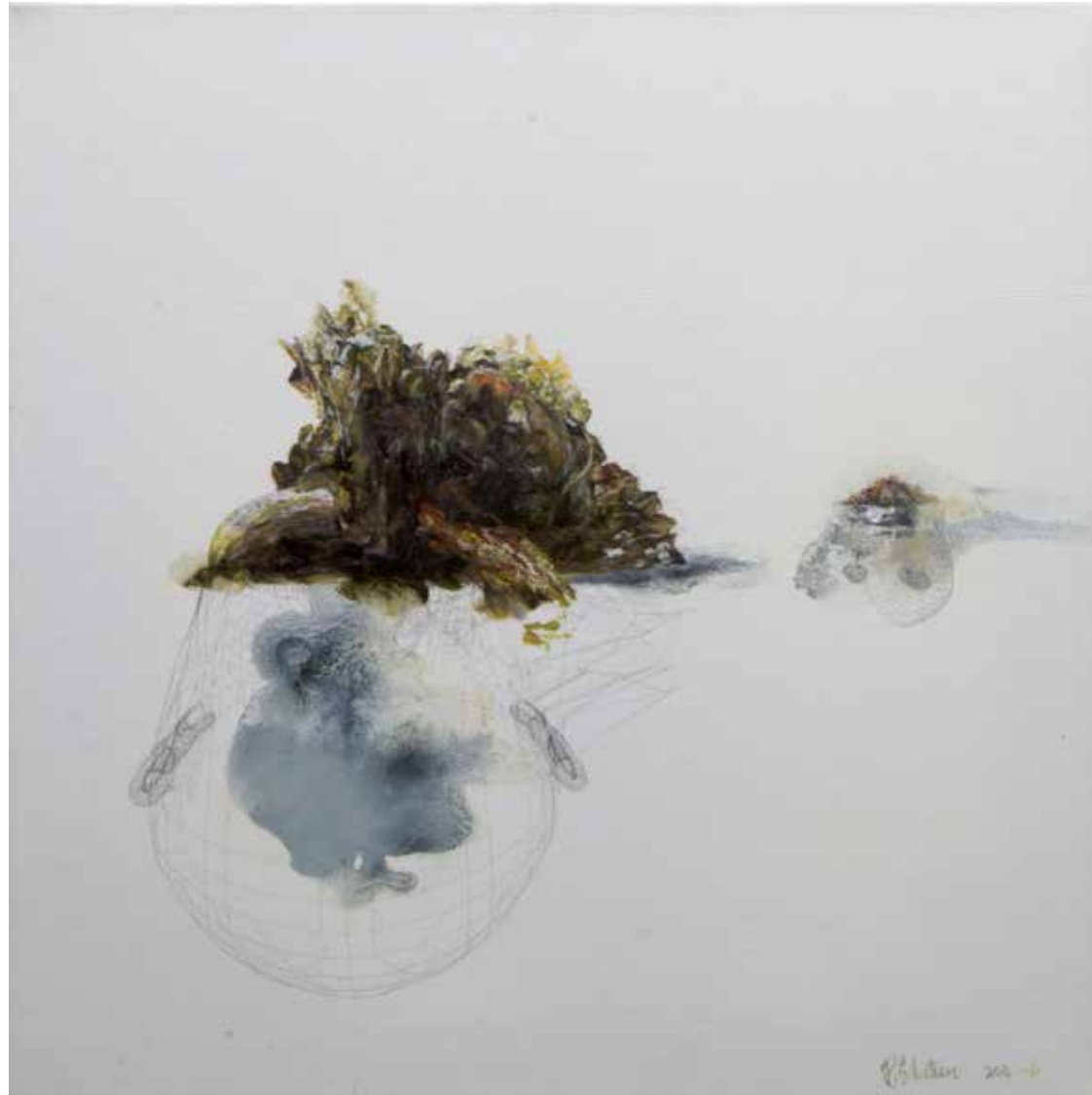
Head in the Sand: Dog 2014-2016 Oil and inkjet print on canvas, 41 x 41 cm R30,000