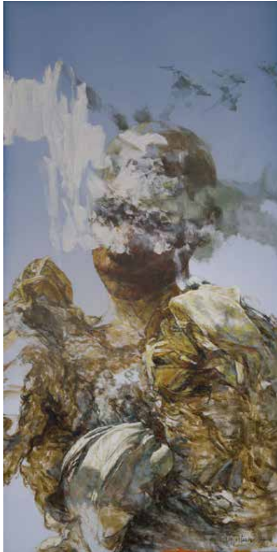
Hollow Men I 2014-2016 Oil and inkjet print on canvas, 78 x 40 cm