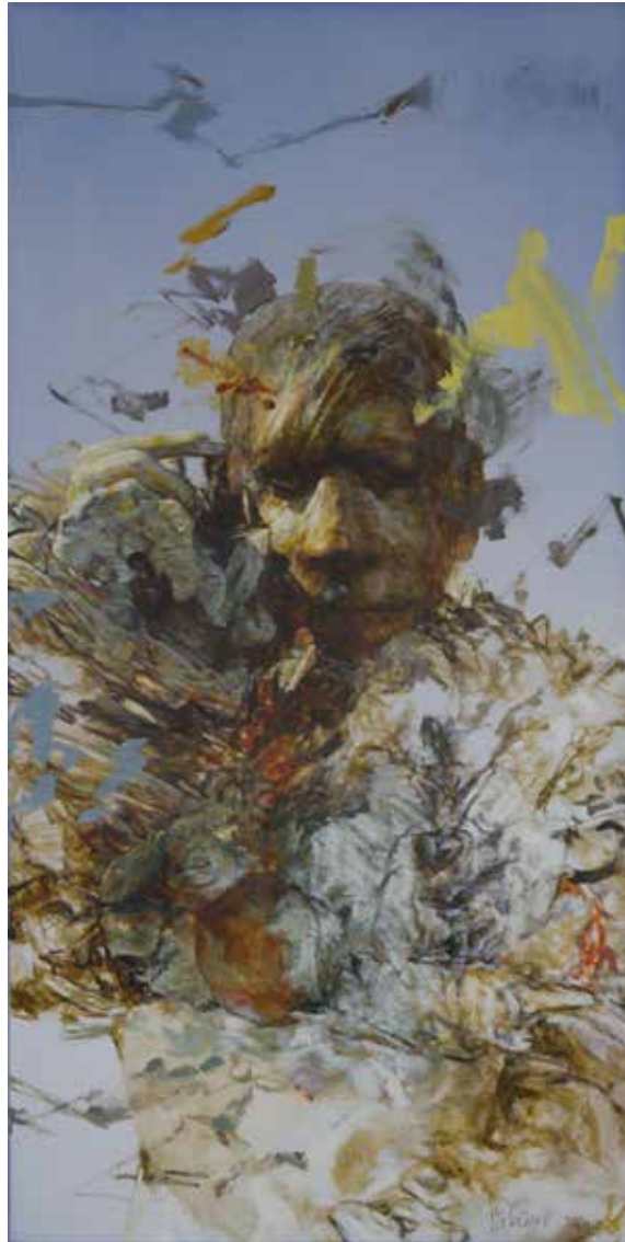
Hollow Men VI 2014-2016 Oil and inkjet print on canvas, 78 x 40 cm