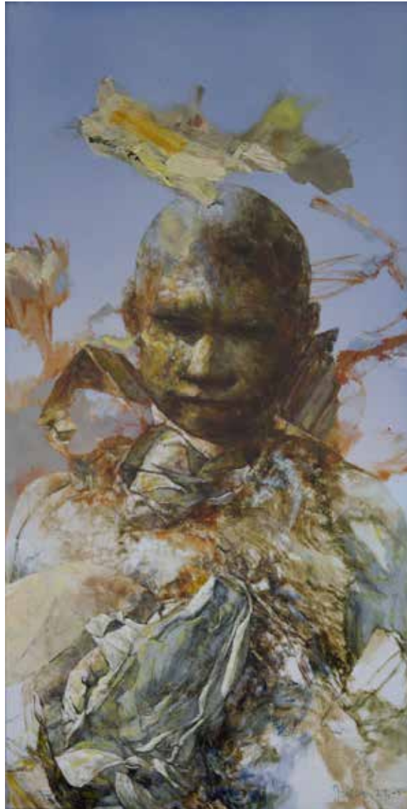
Hollow Men III 2014-2016 Oil and inkjet print on canvas, 78 x 40 cm