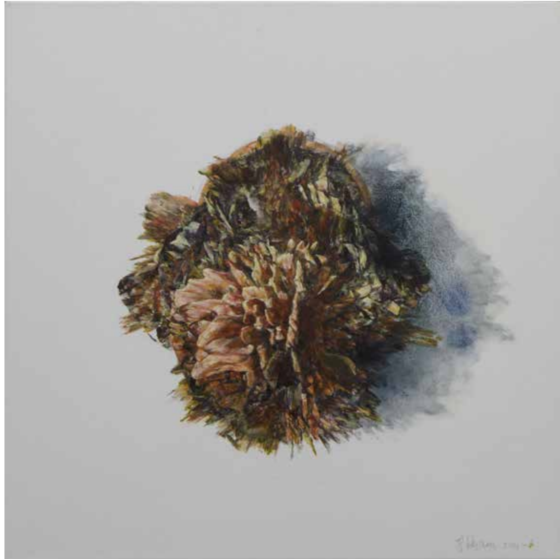
Head in the Sand: Goat 2014-2016 Oil and inkjet print on canvas, 41 x 41 cm