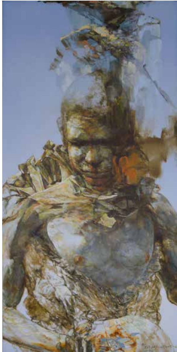
Hollow Men II 2014-2016 Oil and inkjet print on canvas, 78 x 40 cm