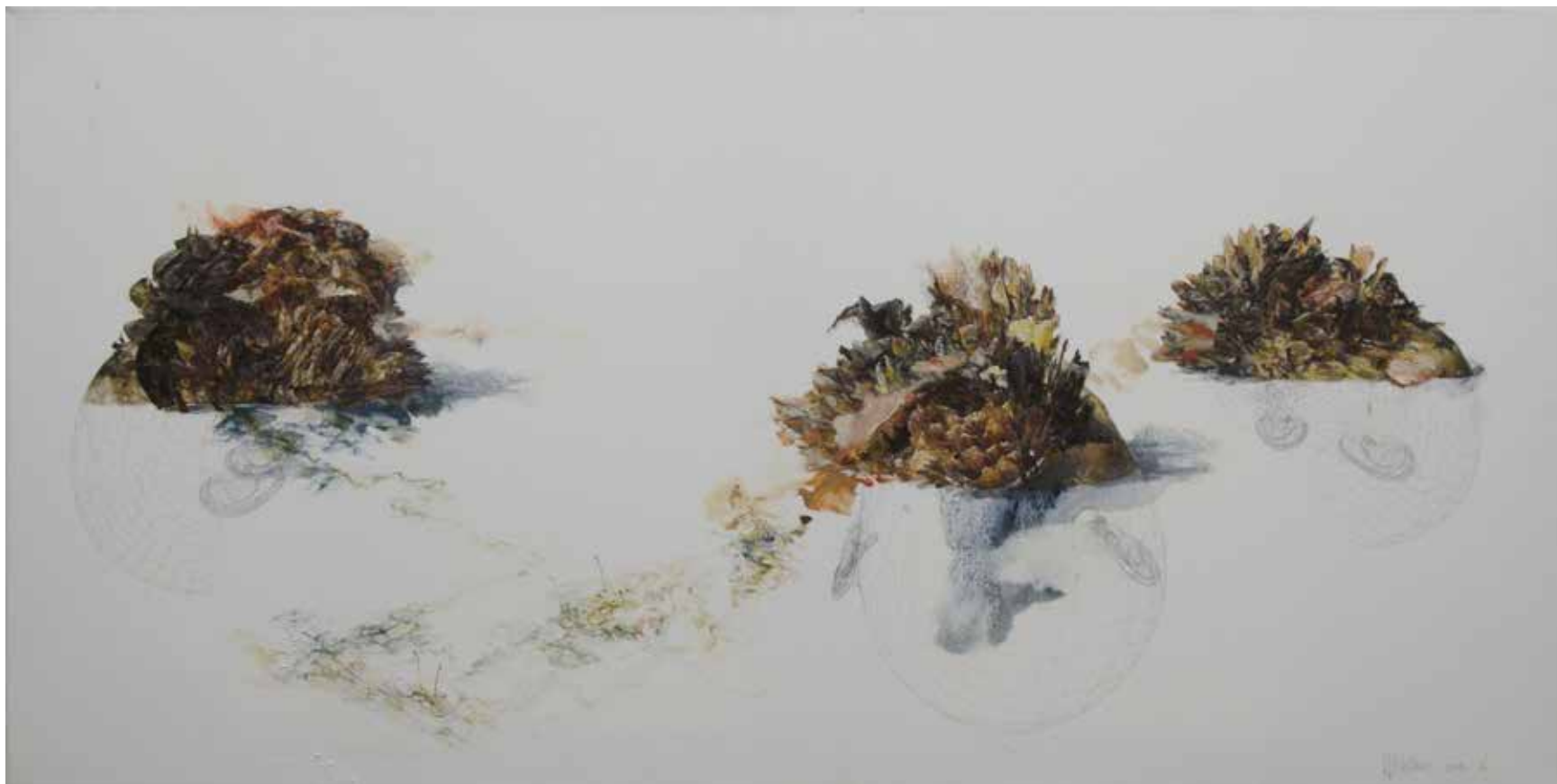
Head in the Sand: Elephant, Horse, Reindeer 2014-2016 Oil and inkjet print on canvas, 41 x 82 cm