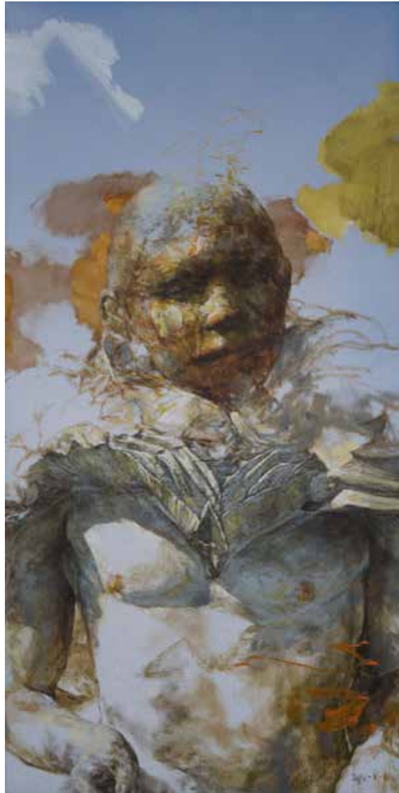
Hollow Men V 2014-2016 Oil and inkjet print on canvas, 78 x 40 cm