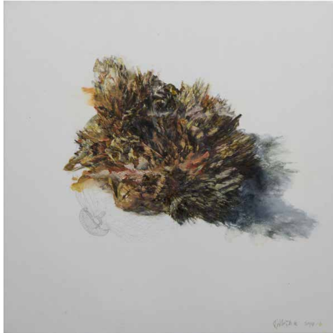
Head in the Sand: Cow 2014-2016 Oil and inkjet print on canvas, 41 x 41 cm