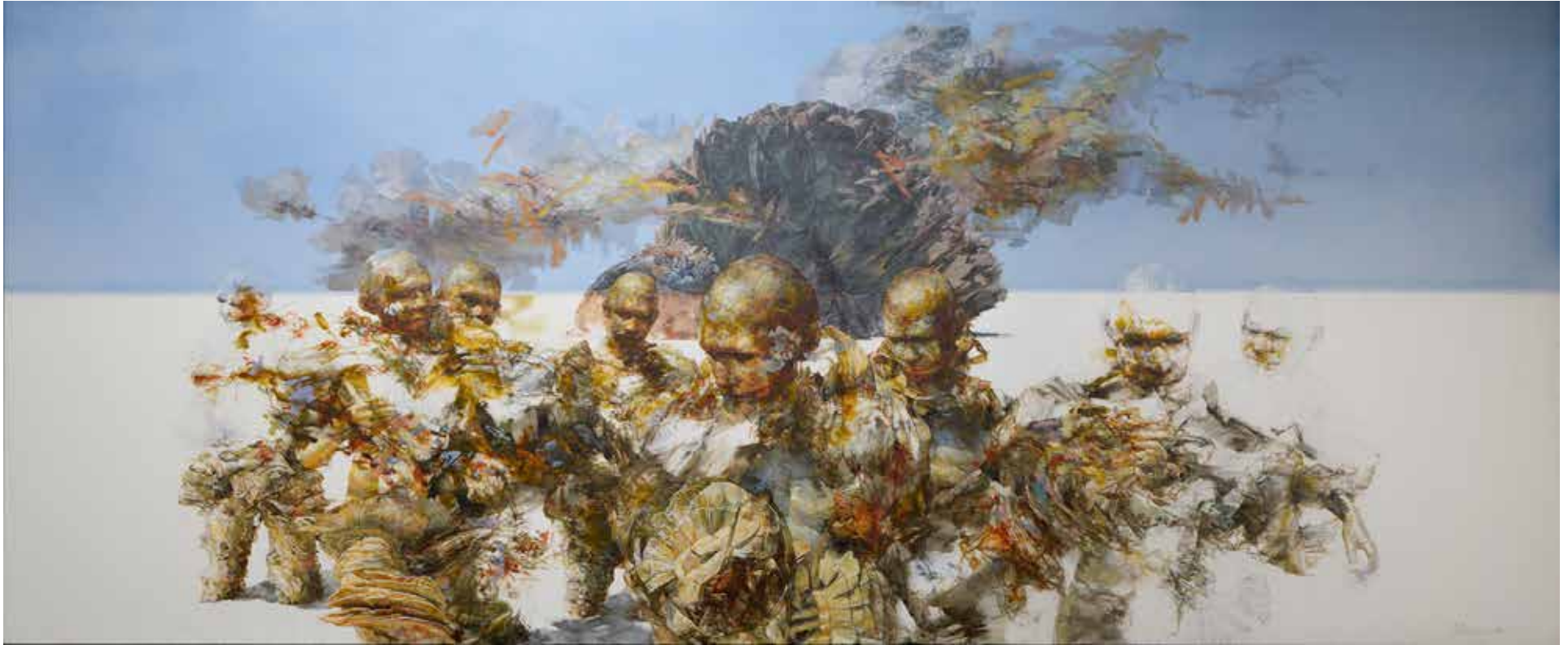
Poster for an extinction, 2014-2016, Oil and inkjet print on canvas, 295 x 123 cm,