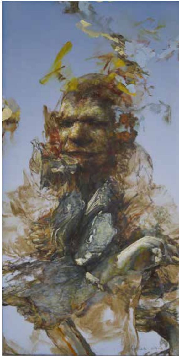
Hollow Men VII 2014-2016 Oil and inkjet print on canvas, 78 x 40 cm