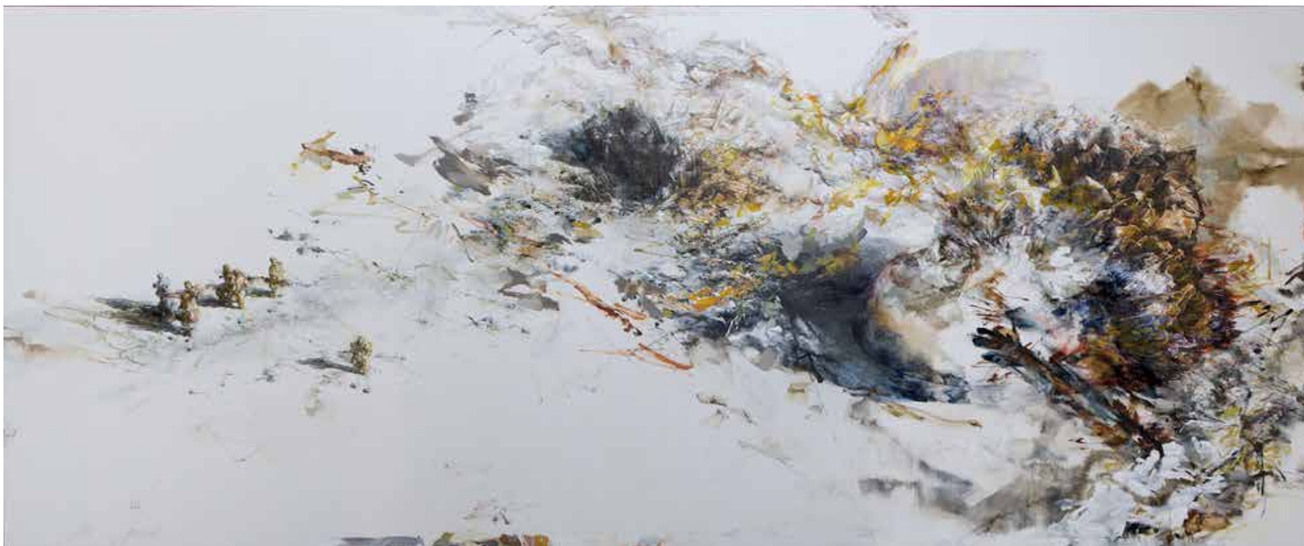
Evacuation 2015-2016 Oil, spray paint and inkjet print on canvas, 295 x 123 cm