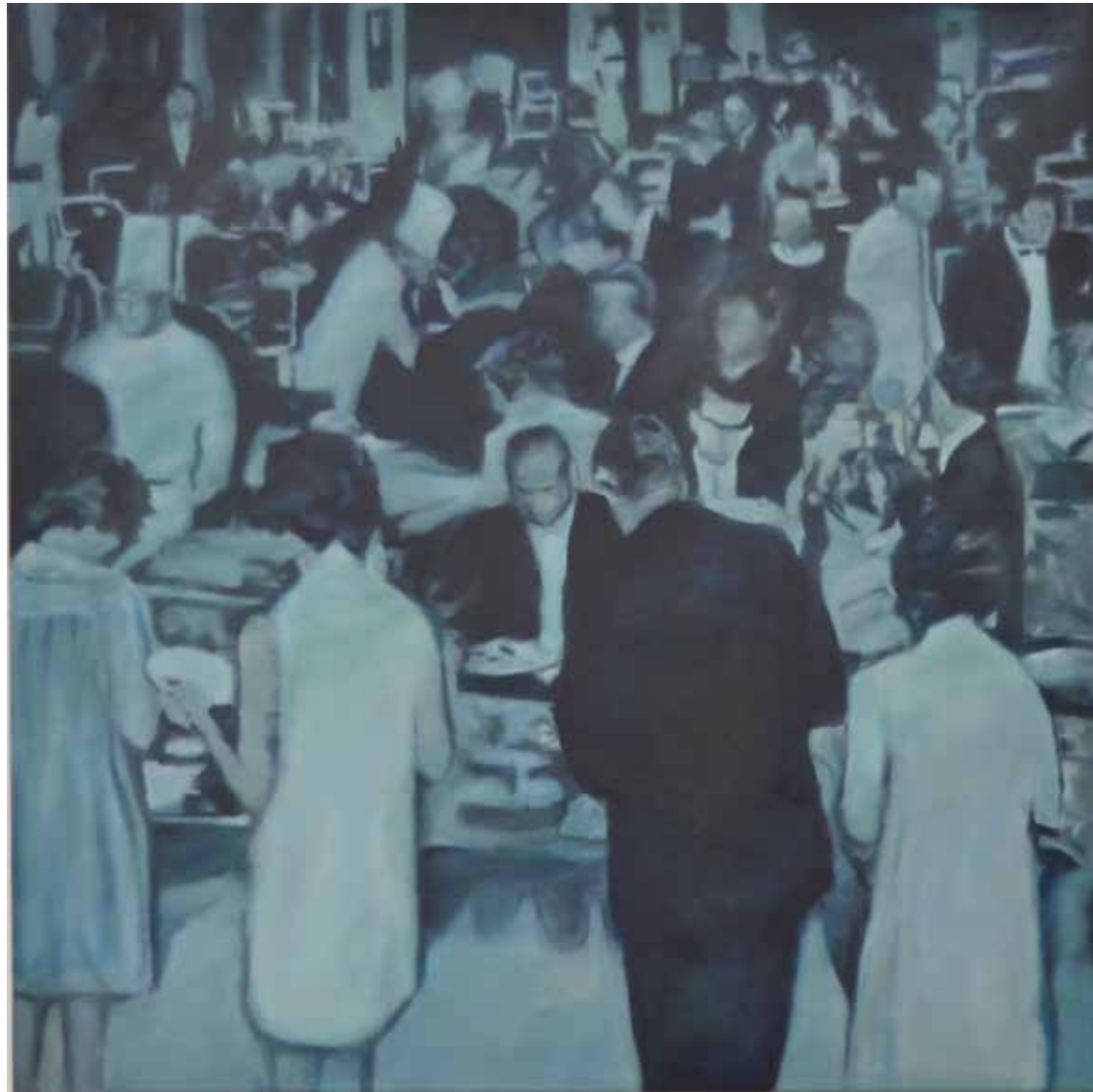
Function, 1960s. 2016. Oil on canvas. 110 x 110 cm