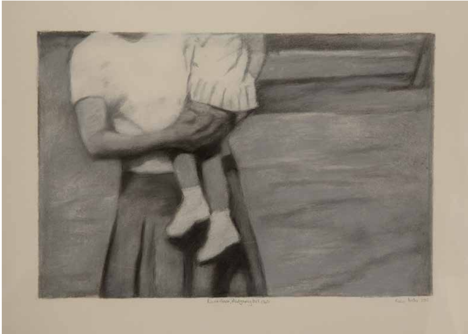
Montgomery Park IV, 2015 Charcoal and pastel, 50 x 70cm