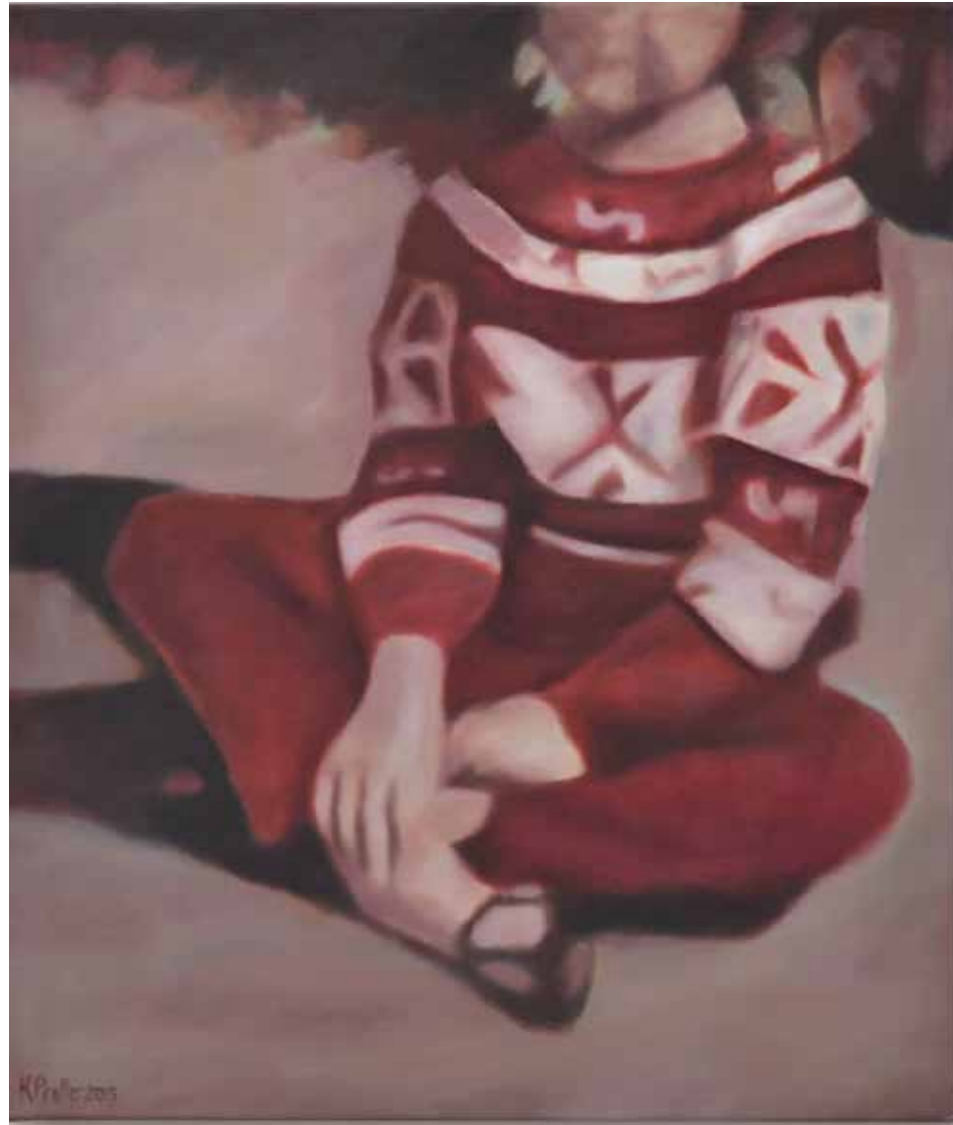
Red Jersey, 2015. Oil on canvas 70 x 60 cm