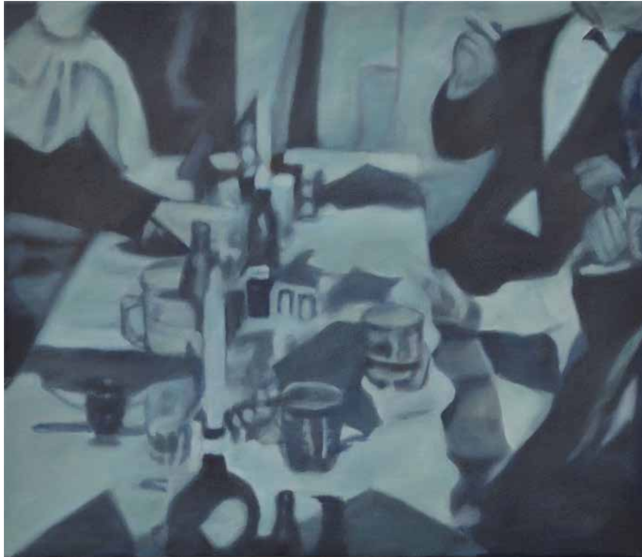
After dinner. 2016. Oil on canvas. 60 x 70 cm