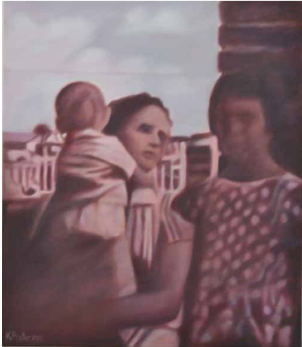
Family. 2015. Oil on canvas 70 x 60 cm