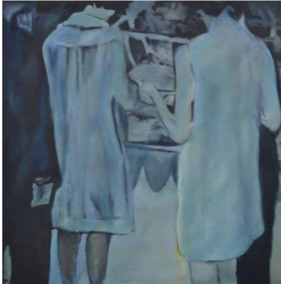
Dishing up. 2016. Oil on canvas, 95 x 95 cm