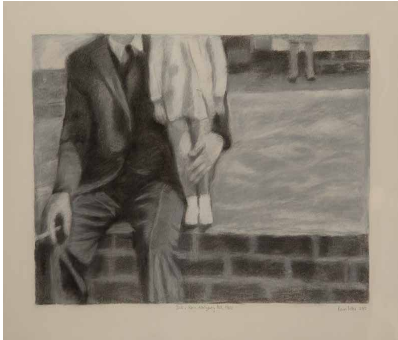
Montgomery Park I, 2015 Charcoal and pastel, 50 x 70cm