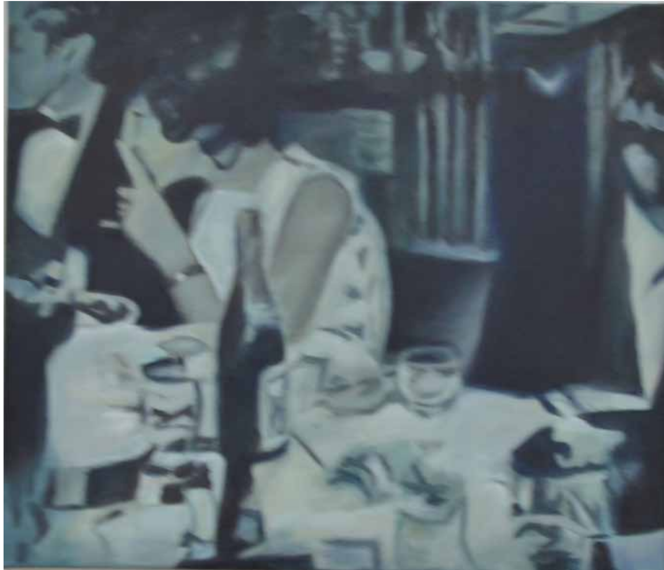
Whispering, 2016. Oil on canvas. 60 x 70 cm