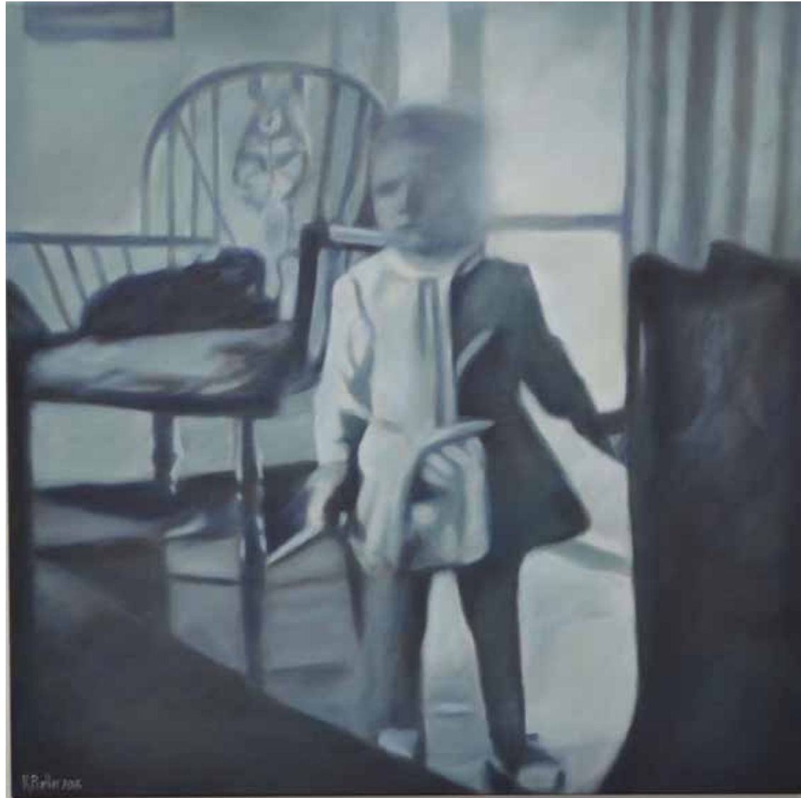
Karin. 2015. Oil on canvas 95 x 95 cm