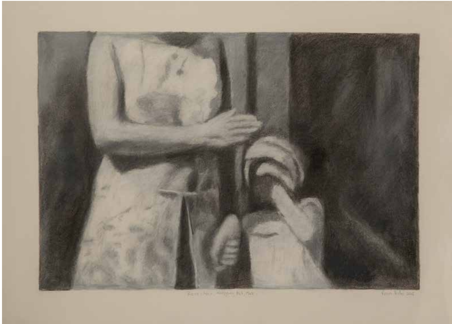
Montgomery Park III, 2015 Charcoal and pastel, 50 x 70cm