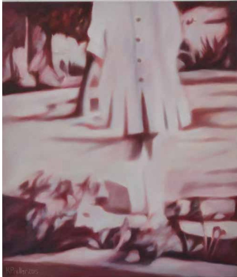
Posing. 2015. Oil on canvas 70 x 60 cm